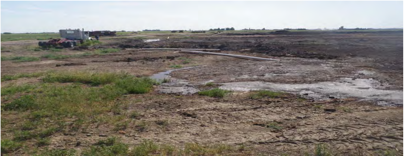
Photo 25: Looking south down the northern edge of the production area.