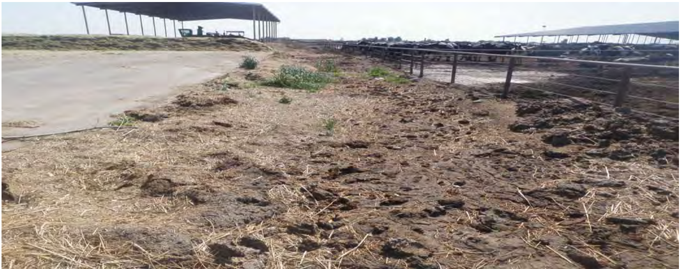
Photo 30: Looking east at the channel that is located immediately north of the corral pictured in Photos 27-29; the channel contains a significant amount of solid manure, slurry manure, and old feed.