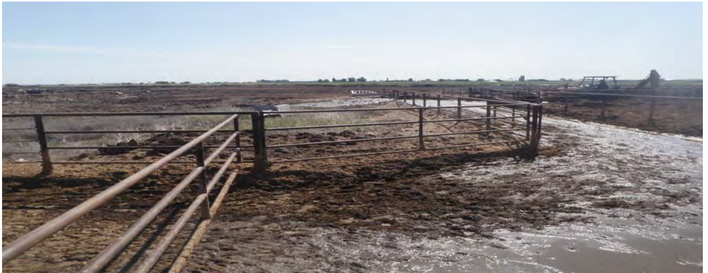
Photo 31: Note tractor pushing slurry manure into an area not designed to store wastewater and/or solid manure. See Photo #32 for a better photo of the area.