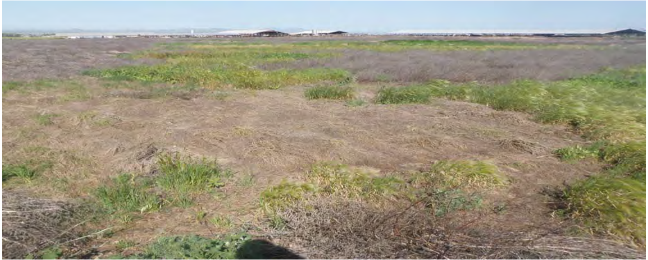
Photo 11: Wastewater Storage Lagoon #1. The embankments contained excessive weeds and there was no staff-gauge.