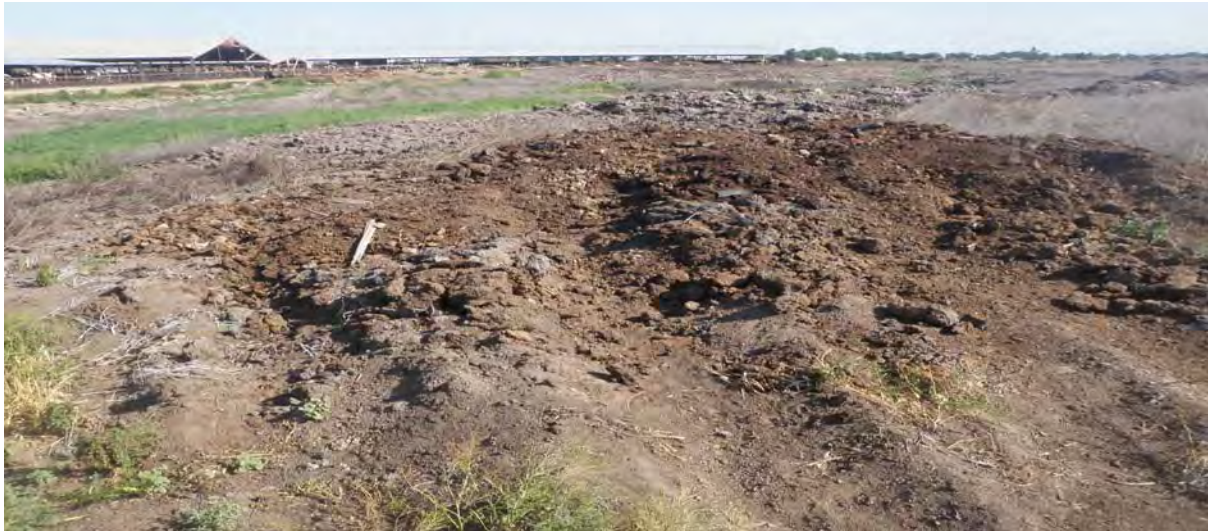
Photo 7: Looking north at the area between the Settling Basin #1 and Settling Basin #2; the pictured area contains a significant amount of solid and slurry manure.