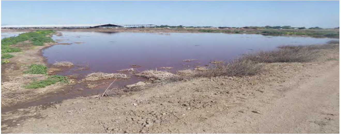
Photo 13: Wastewater Storage Lagoon #3. The embankments contained excessive weeds and there was no staff-gauge.