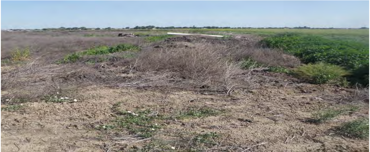
Photo 9: Looking northeast at the eastern end of the Settling Basin #2; the material composing a portion of the eastern embankment appeared to be manure.