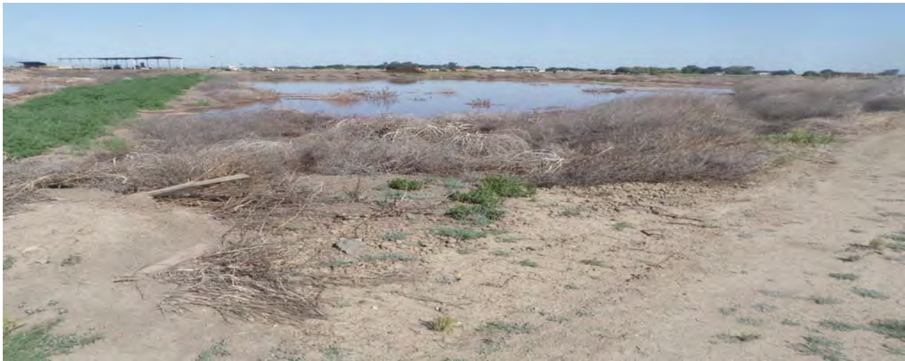
Photo 15: Wastewater Storage Lagoon #5. The embankments contained excessive weeds and there was no staff-gauge. This pond is irregularly shaped containing a small alcove full of weeds in the northeast corner (see Photo 16-17).