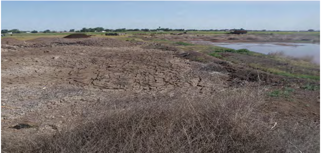
Photo 19: Looking north at the area west of the storage lagoons. This area contained massive amounts of solid manure, slurry manure, and liquid wastewater.