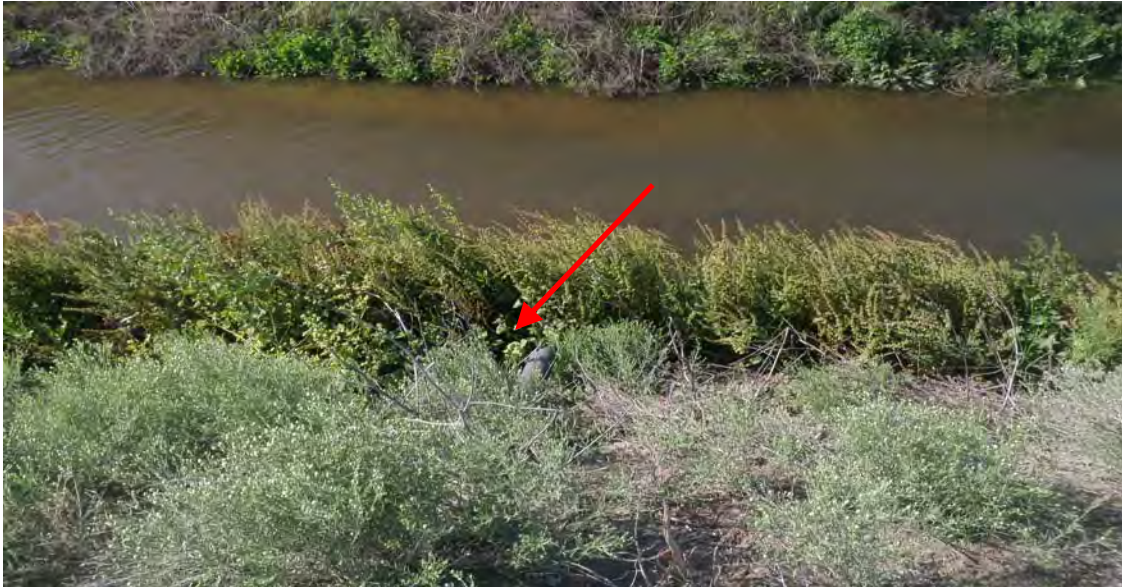
Photo 5: Photo of a black PVC pipe on the bank of the Main Drain Canal of Naglee-Burk Irrigation District; the pipe is connected to Settling Basin #1. Note that the pipe is uncapped.