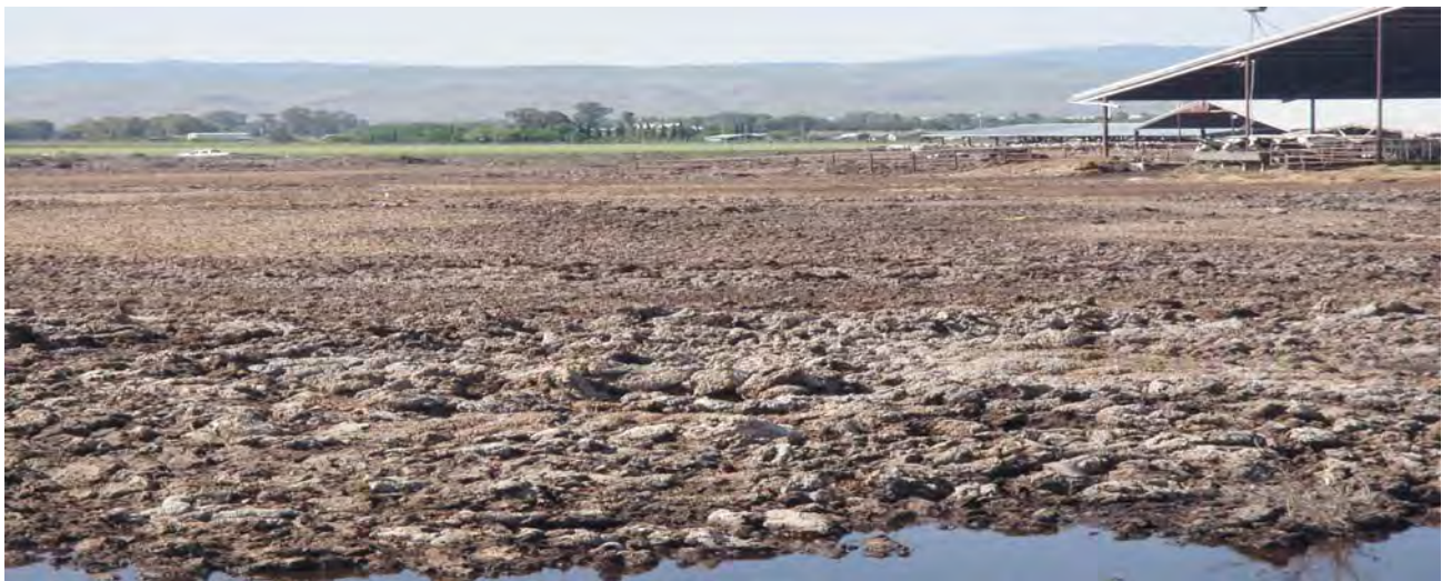
Photo 24: Looking west at an area west and northwest of the wastewater storage lagoons – note massive amounts of solid manure, slurry manure, and liquid wastewater.