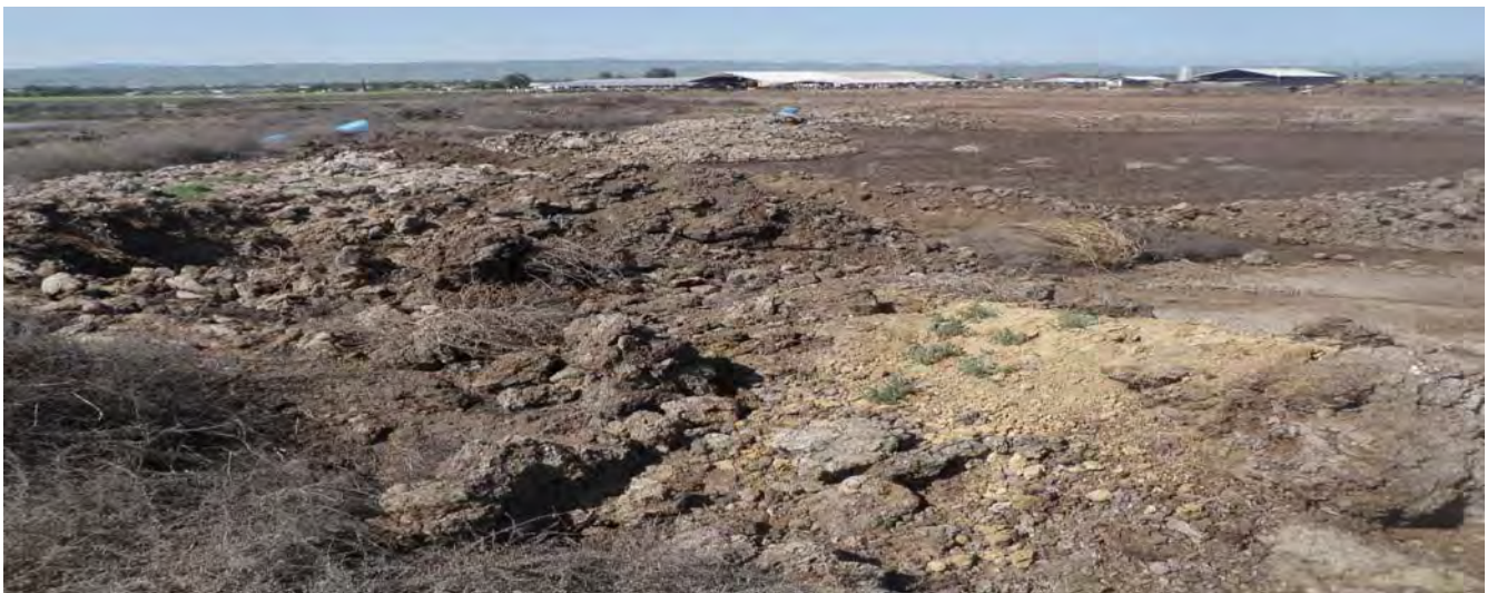
Photo 22: Looking southwest down the western edge of the storage lagoons – note massive amount of solid manure, slurry manure, and liquid wastewater.