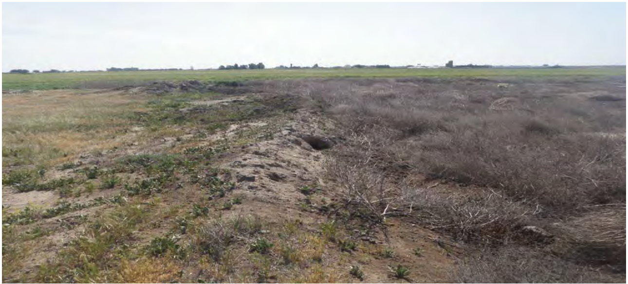
Photo 17: Wastewater Storage Lagoon #5. Note the weeds that extend from the lagoon to the left in the center of the photo (creating the alcove and irregular shape).