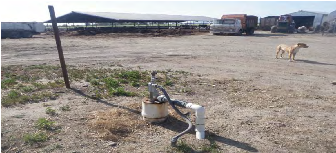
Photo 2: Well #1 with a corral in the background. The corral is approximately 70' from the well. See Photo #3 for a close-up of the corral and the solid manure being stored adjacent to the corral.