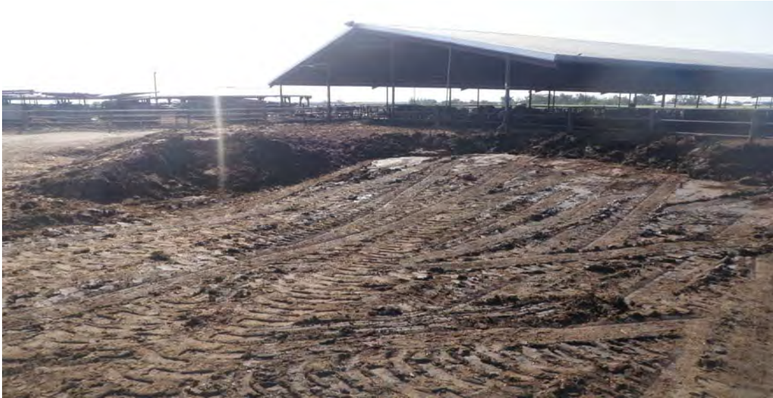
Photo 3: The corral near Well #1 contained significant amounts of solid manure. Additionally there was slurry manure being stored adjacent to the corral (about 70' from Well #1).