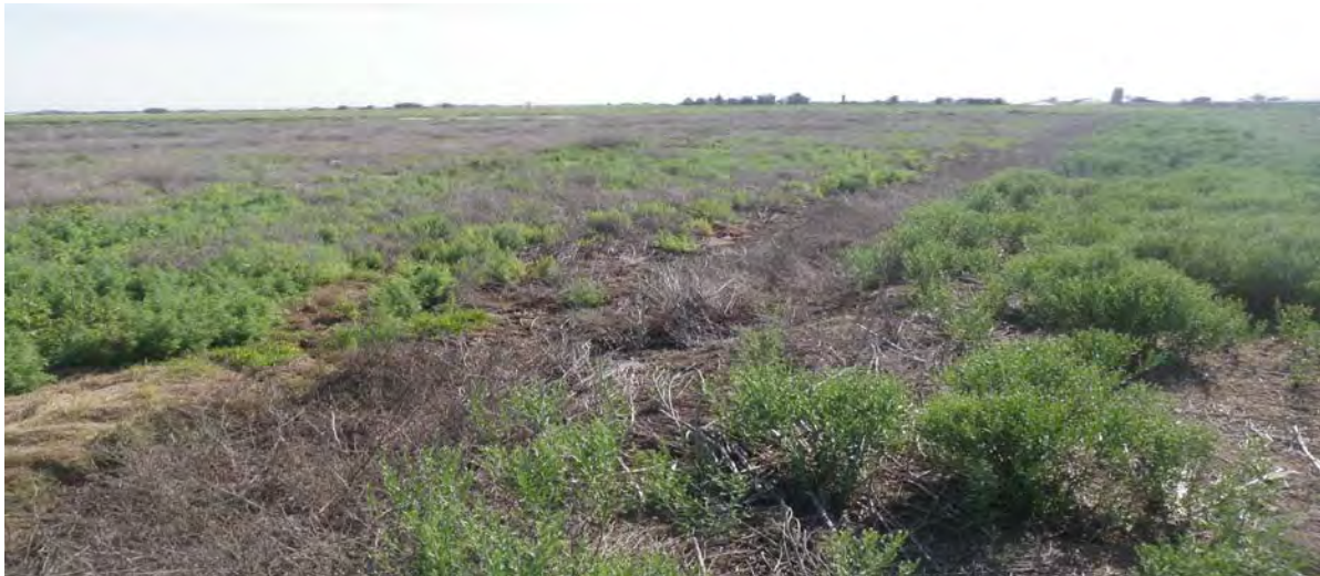
Photo 8: Looking northeast at Settling Basin #2. The amount of weeds on the settling basin embankments made it impossible for staff to determine embankment integrity and/or if rodent holes are present.