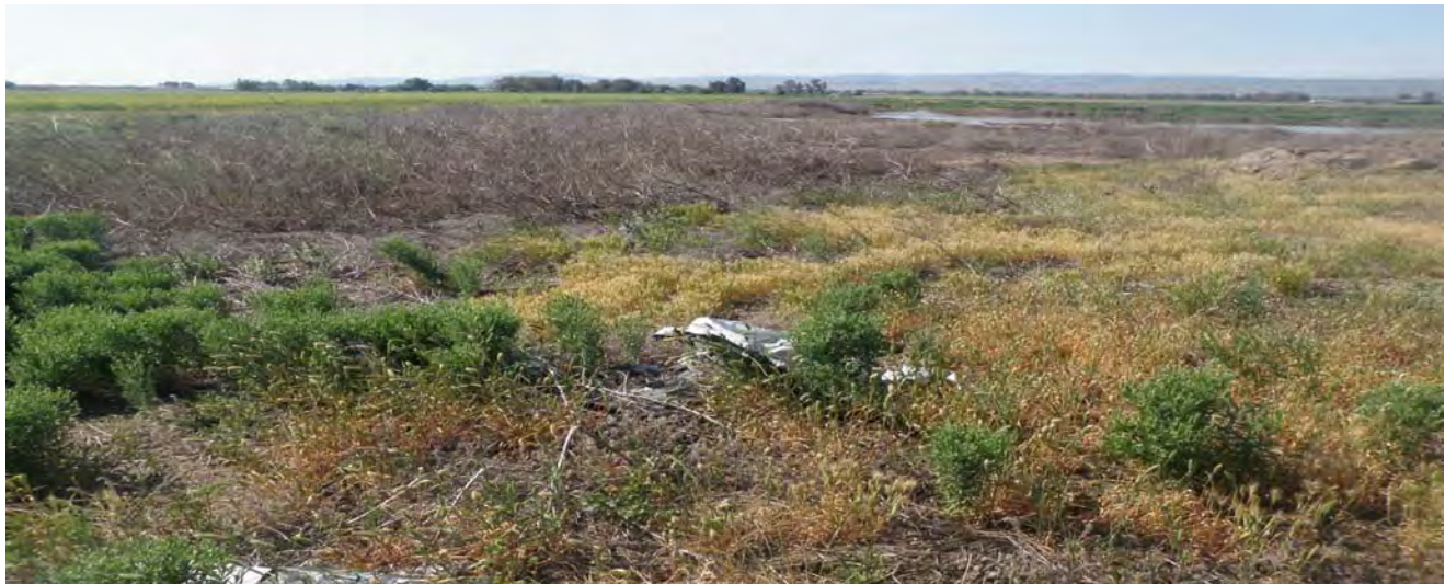
Photo 16: Small alcove in the northeast corner of Wastewater Storage Lagoon #5.