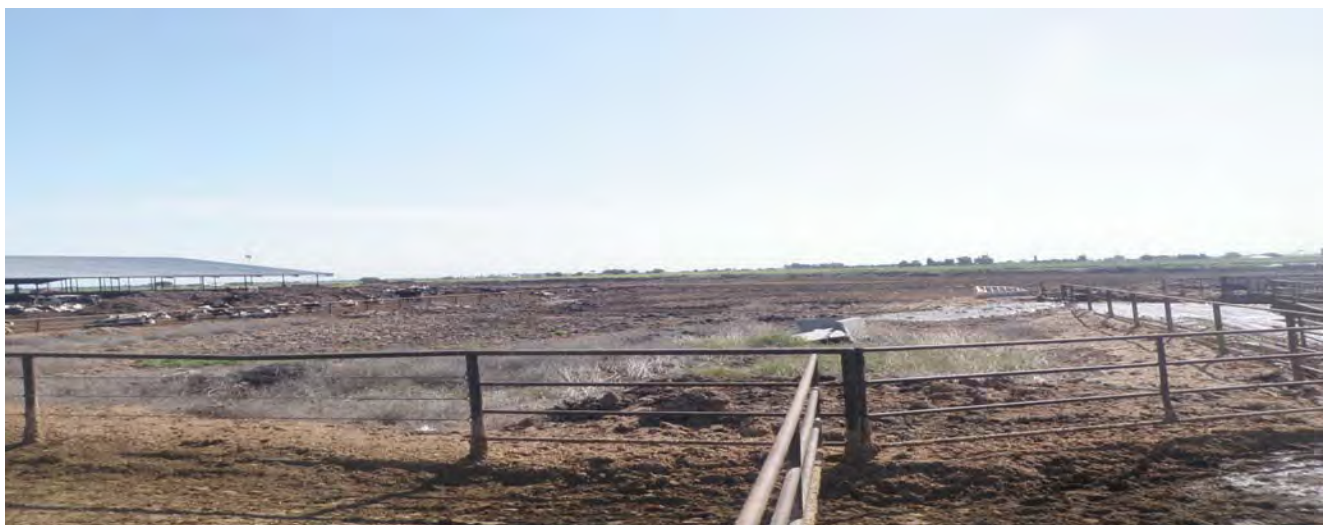
Photo 32: The operator dumps slurry manure and wastewater into this open lot; which is not designed to store wastewater or solid manure.