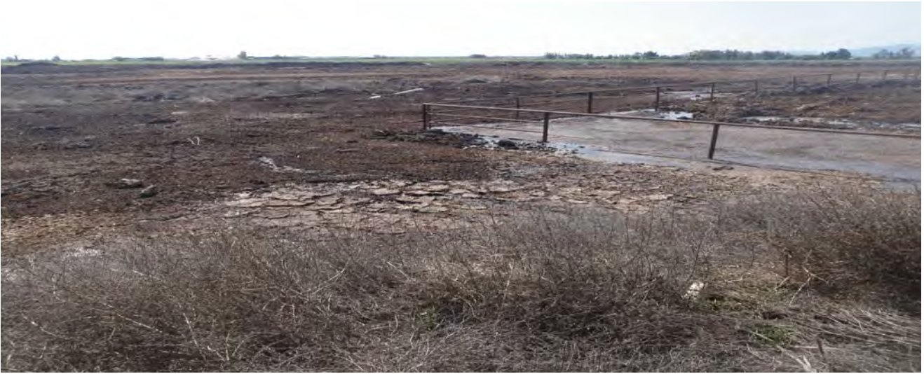
Photo 27: The eastern end of this corral was under wastewater at the time of our visit.