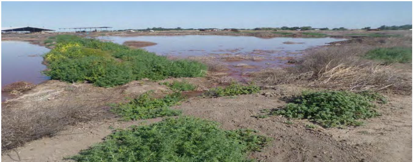
Photo 14: Wastewater Storage Lagoon #4. The embankments contained excessive weeds and there was no staff-gauge.