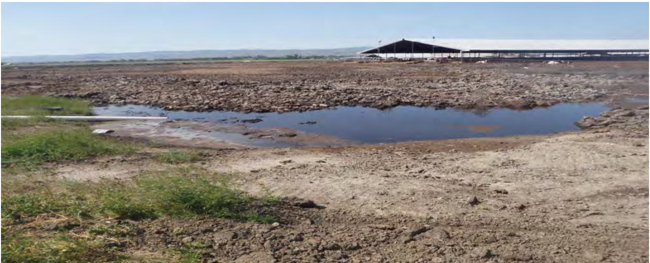
Photo 23: Looking southwest at an area west and northwest of the wastewater storage lagoons – note massive amounts of solid manure, slurry manure, and liquid wastewater. See Photo #24 for a different view.