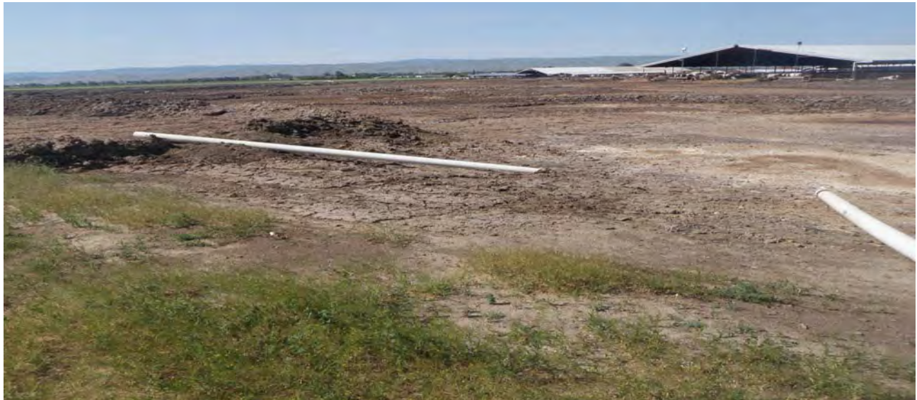
Photo 21: Looking southwest at the area located west of storage lagoons; this area contained massive amounts of solid manure, slurry manure, and liquid wastewater.