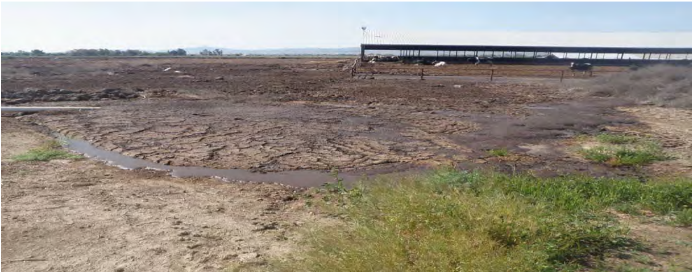
Photo 26: Looking south from the northern perimeter of the production area. Note massive amounts of solid manure, slurry manure, and liquid wastewater.