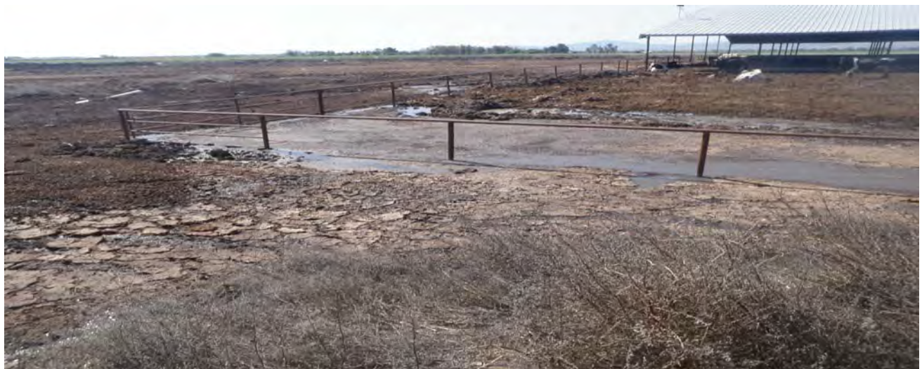
Photo 28: Eastern end of the northern corral was under wastewater at the time of our visit.