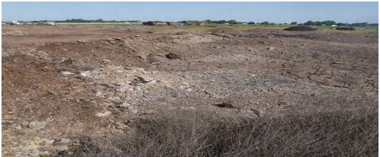
Photo 18: Looking north at the area west of the storage lagoons. This area contained massive amounts of solid manure, slurry manure, and liquid wastewater.