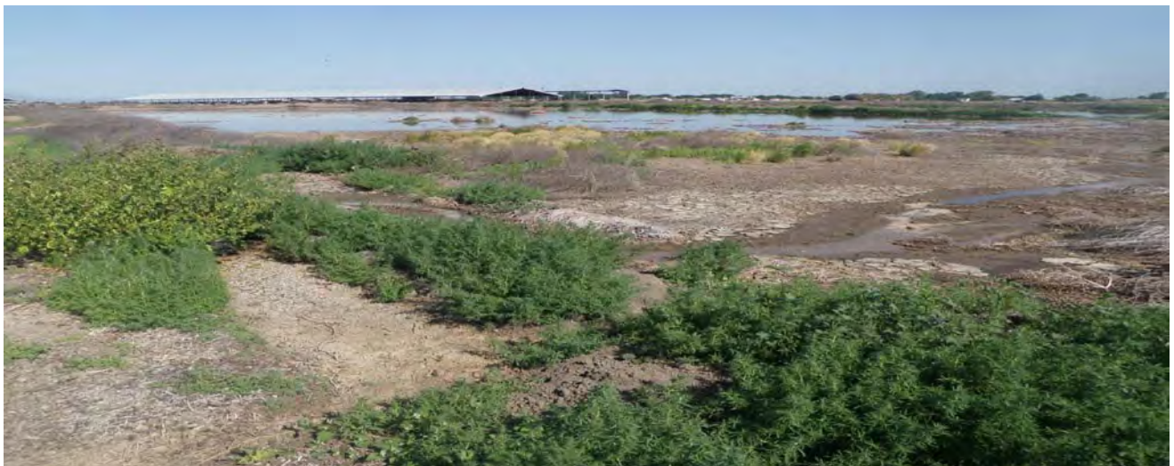
Photo 12: Wastewater Storage Lagoon #2. The embankments contained excessive weeds and there was no staff-gauge.