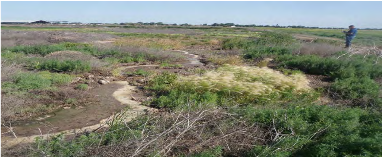
Photo 10: Looking north at the conveyance channel that connects Settling Basin #2 to Wastewater Storage Lagoon #1. This is typical of all the lagoons at the facility – channels connecting the lagoons have marginal slope, no definition, and contained excessive weeds.