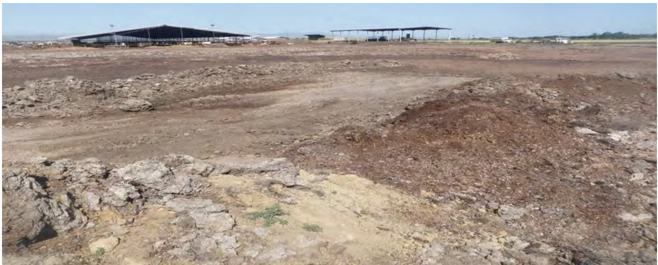
Photo 20: Looking west at the area west of the storage lagoons. This area contained massive amounts of solid manure, slurry manure, and liquid wastewater.