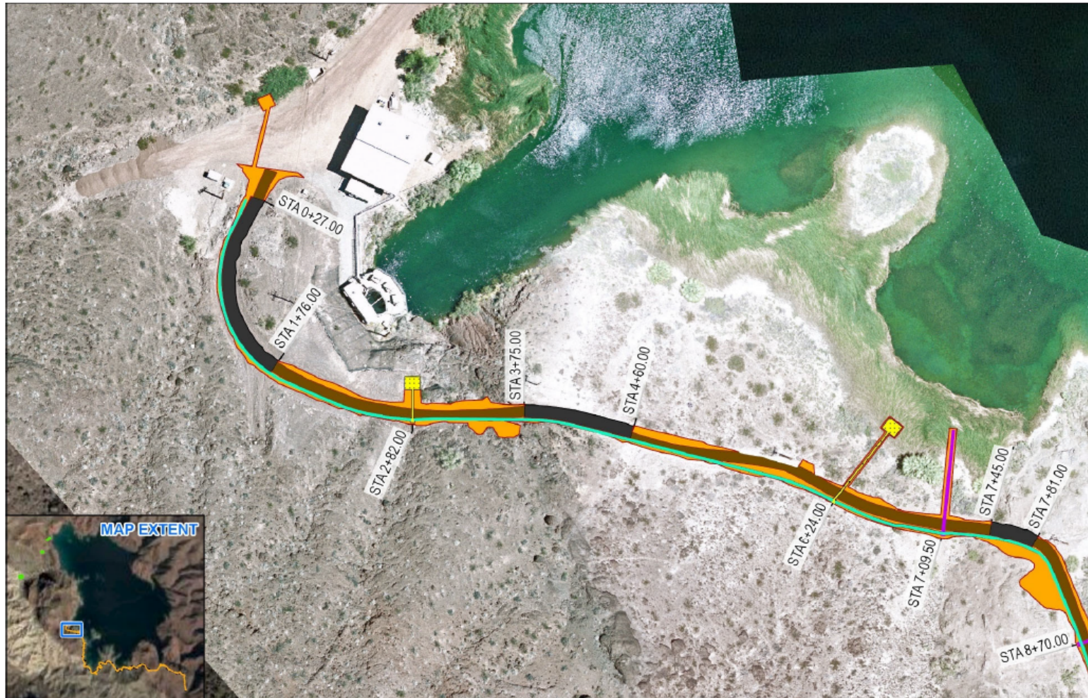
Figure 4: Project Components