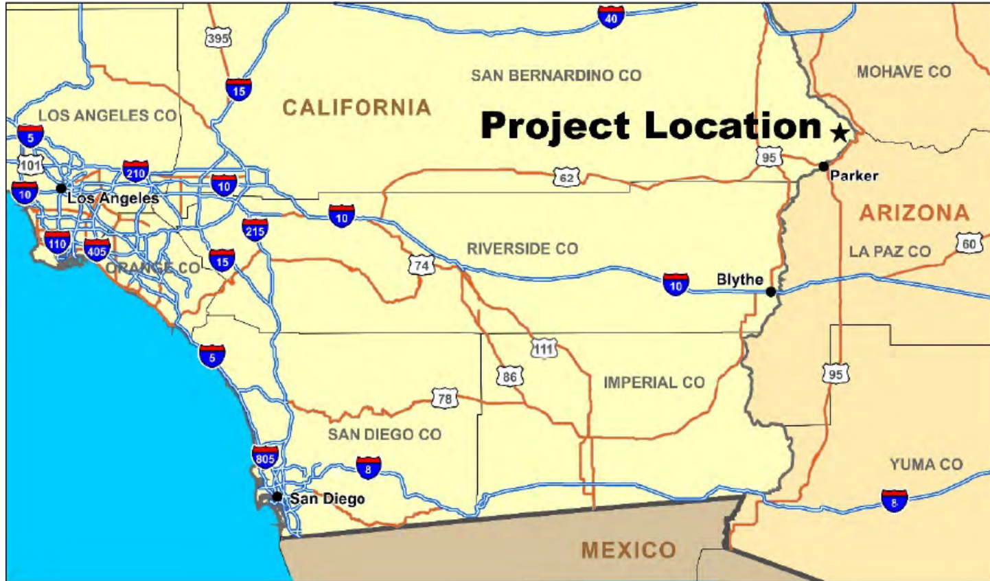
Figure 1: Project Location 9