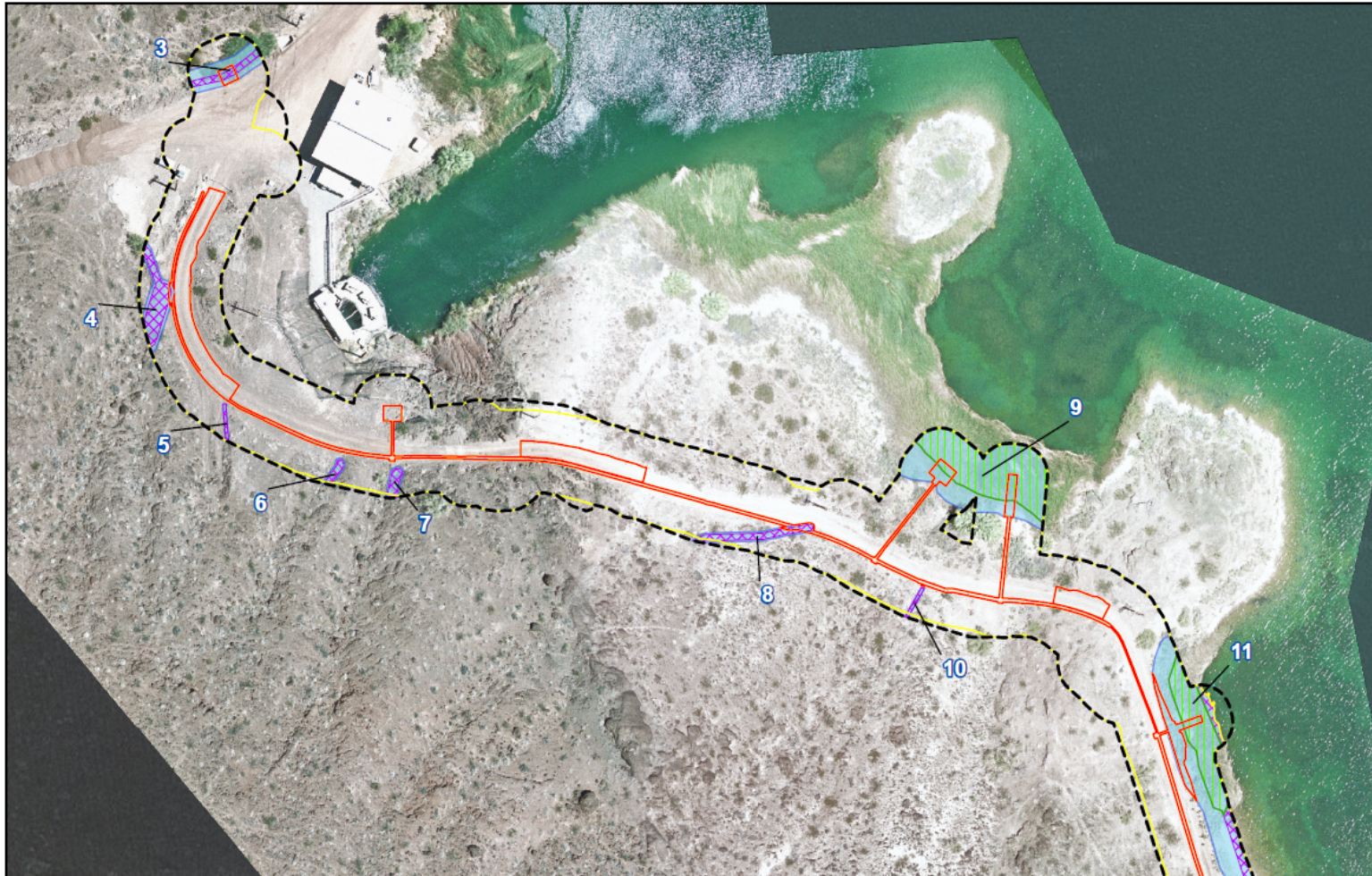
Figure 5: Jurisdictional Waters