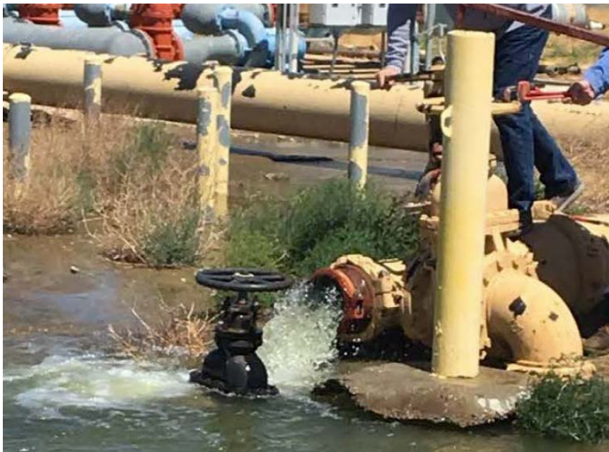
Figure 1 – Photograph of coupling failure at Palmdale Wastewater Reclamation Plant Agricultural Site irrigation system booster pump station.

Water Board staff requested that the Districts notify us regarding the implementation of each recommendation.