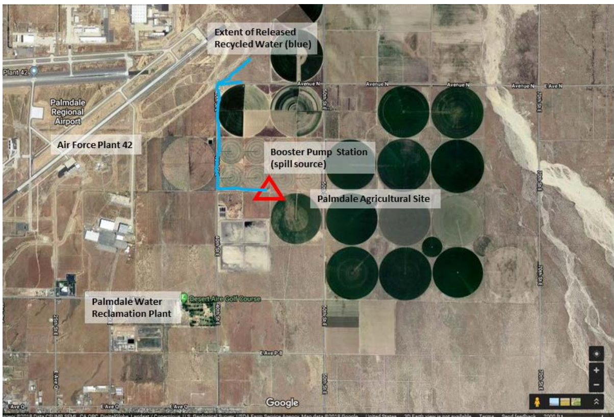
Figure 2 – Map showing location of June 16 to 17, 2018, 4.55-million-gallon spill of tertiary treated, disinfected recycled water at the Palmdale Wastewater Reclamation Plant. Blue line shows extent of the spill.