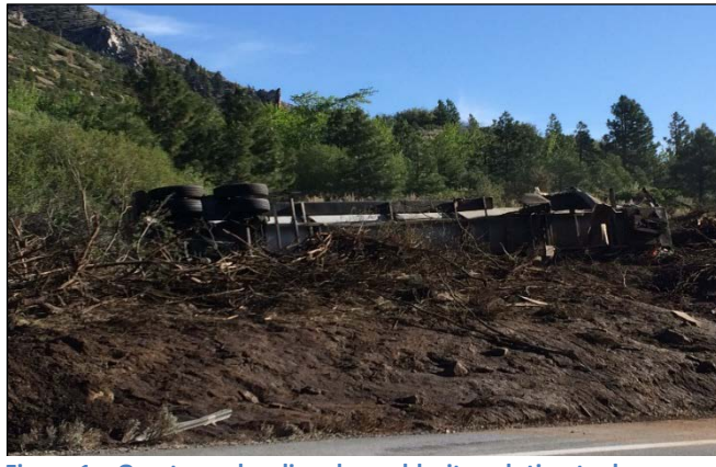
Figure 1 – Overturned sodium hypochlorite solution tanker trailer on Highway 88 embankment

On May 9, 2018, a tractor-trailer hauling approximately 4,900 gallons of 12.5 percent sodium hypochlorite (chlorine bleach) solution traveling east bound on Highway 88 near the town of Woodfords lost control and crashed on the north side of the highway. The tractor-trailer came to rest on the embankment on the north side of the highway. The tanker trailer ruptured on impact, causing the entire volume of sodium hypochlorite solution to be