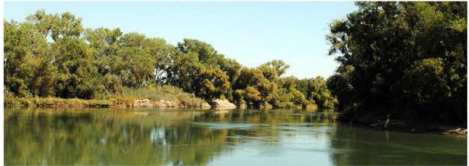
The Sacramento River