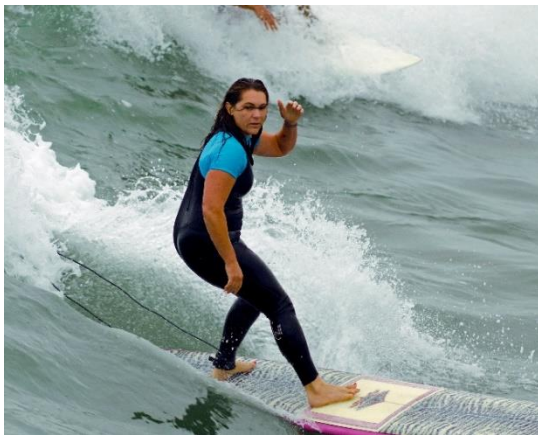
Surfer at Ocean Beach, San Diego County