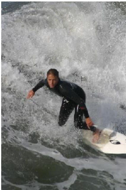
Surfer at Ocean-Beach, San-Diego-County

In addition, the fecal coliform concentration shall not exceed 400 organisms per 100 ml for more than 10 percent of the total samples during any 30-day period.