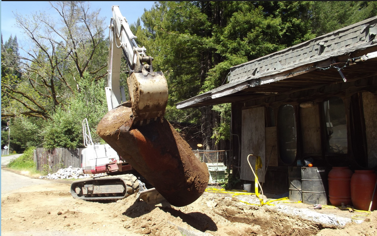
Photograph 1: UST being removed by a track-mounted excavator

The numbers presented here represent cases statewide and includes cases assigned to former LOPs, USEPA, DTSC and Los Angeles County, which may not be reported in other figures in this report that exclude these agencies.