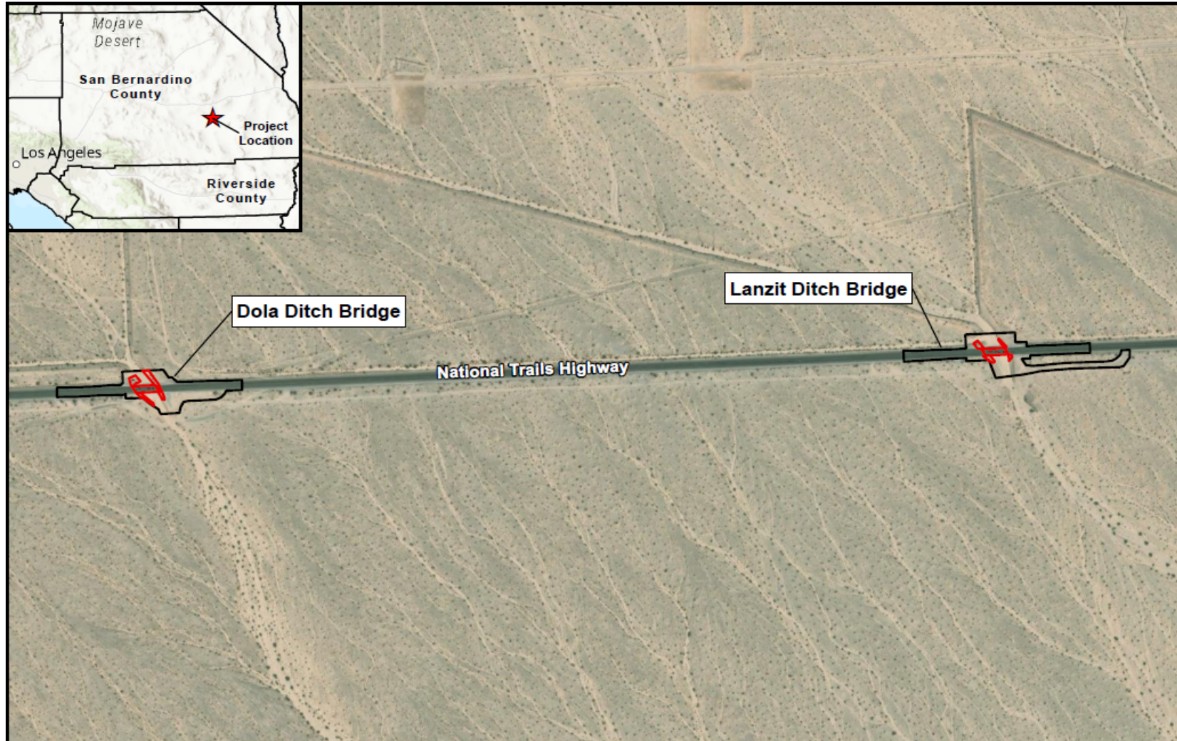
Figure 2: Project Location