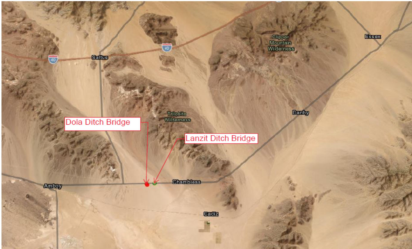
Figure 1: Vicinity Map 9