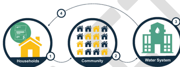
Figure 3: Nexus of Affordability Definitions

established by the board in order to supply, treat, and distribute potable water that complies with federal and state drinking water standards.” The Affordability Assessment evaluates several different stakeholder-developed affordability indicators to identify communities that may be experiencing affordability challenges. Legislation does not define what the Affordability Threshold should be. Nor is there specific guidance on the perspective in which the State Water Board should be assessing the Affordability Threshold. The figure below illustrates the nexus of affordability definitions that exist and why household and community affordability are important to understand when assessing a water system’s financial capacity.