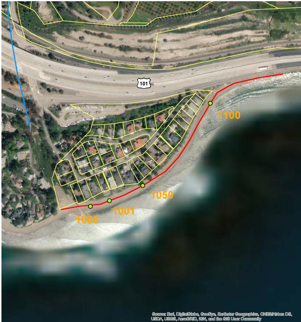
Figure 3 Rincon Beach Sampling Stations