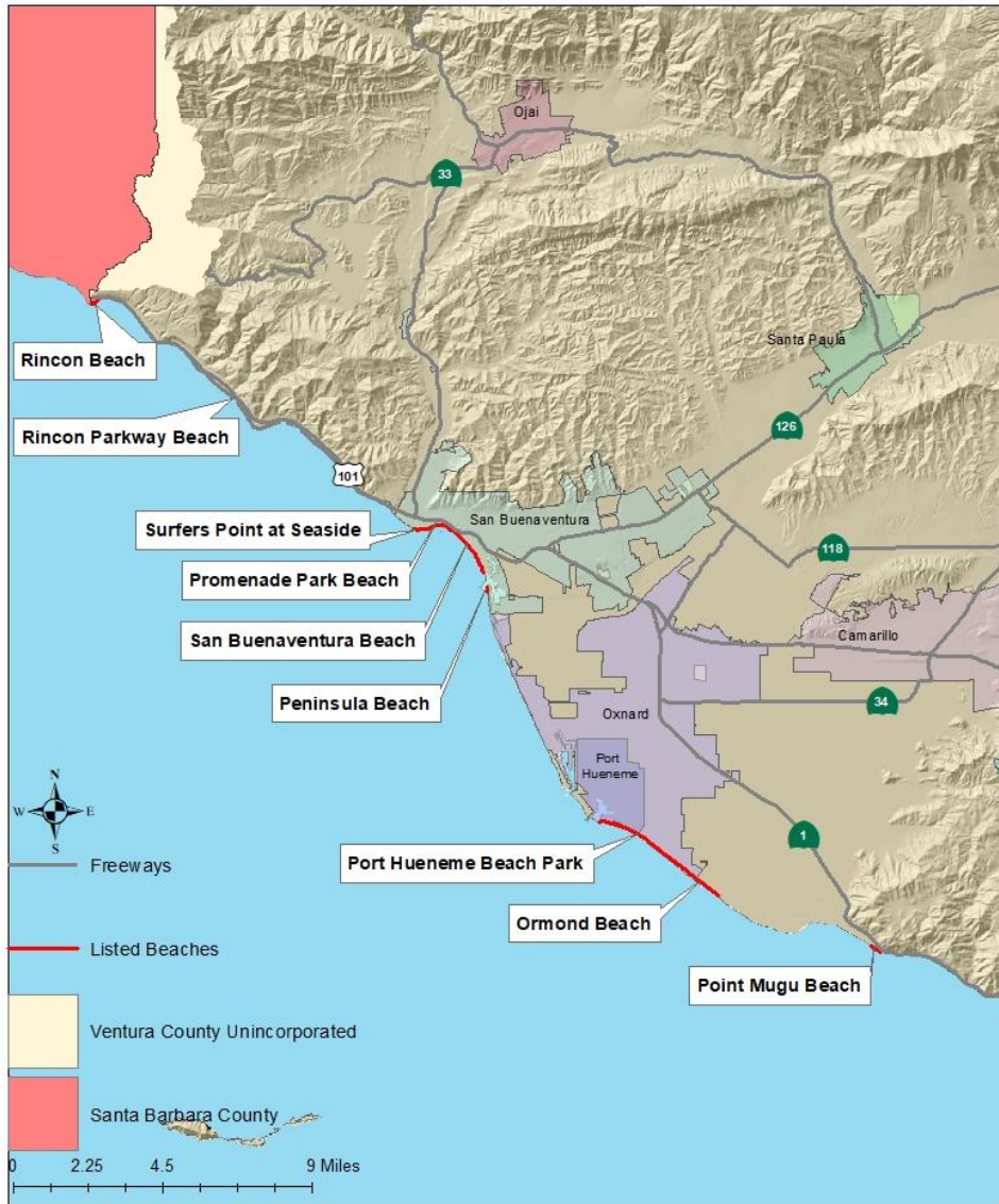
Figure 1 Ventura County Beaches on 2014/2016 303(d) List