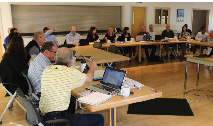
Photo above: A meeting of Bay Area Clean Water Agencies (BACWA), which works with State, federal, and non-governmental organizations to enhance the San Francisco Bay environment

At the local level, we collaborate with the local cities and counties, wastewater agencies, Bay Area Clean Water Agencies, Bay Area Municipal Stormwater Collaborative, San Francisco Estuary Institute, San Francisco Baykeeper, Save the Bay, San Francisco Bay Conservation and Development Commission, the Bay Planning Coalition, the Bay Area Regional Collaborative, the San Francisco Bay Joint Venture, the Bay Area One Water Network, and the San Francisco Estuary Partnership.