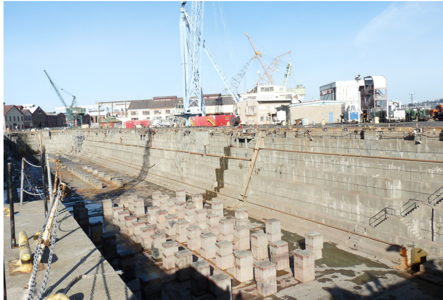
Photo below: Dry docks at Mare Island, covered under the Dry Docks NPDES general permit