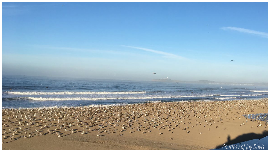
Photo to right: Seagulls at Venice Beach, covered by the Pillar Point Harbor and Venice Beach Bacterial TMDL

We assess the condition of our region's water bodies and report that information to U.S. EPA as part of an Integrated Report. The Integrated Report identifies impaired waters and the pollutants causing those impairments. The list of impaired water bodies is referred to as the 303(d) List, referencing the identification requirement in section 303(d) of the Clean Water Act. We establish Total Maximum Daily Loads (TMDLs) to address water body impairments. TMDLs are water body and pollutant specific plans to restore water quality. We develop a problem statement, identify sources of pollutants, and specify actions to restore water quality. We have developed and are implementing 24 TMDLs.