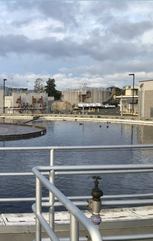
Photo to left: Secondary clarifier at Novato Sanitary District's wastewater treatment plant, covered under a NPDES permit