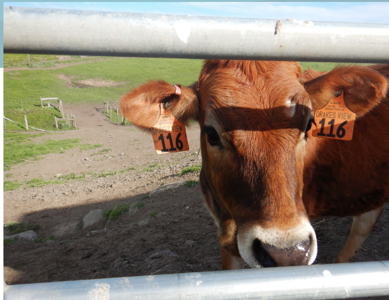
Photos from left to right: Potrero Hills Landfill in Fairfield, covered under the Land Disposal Program