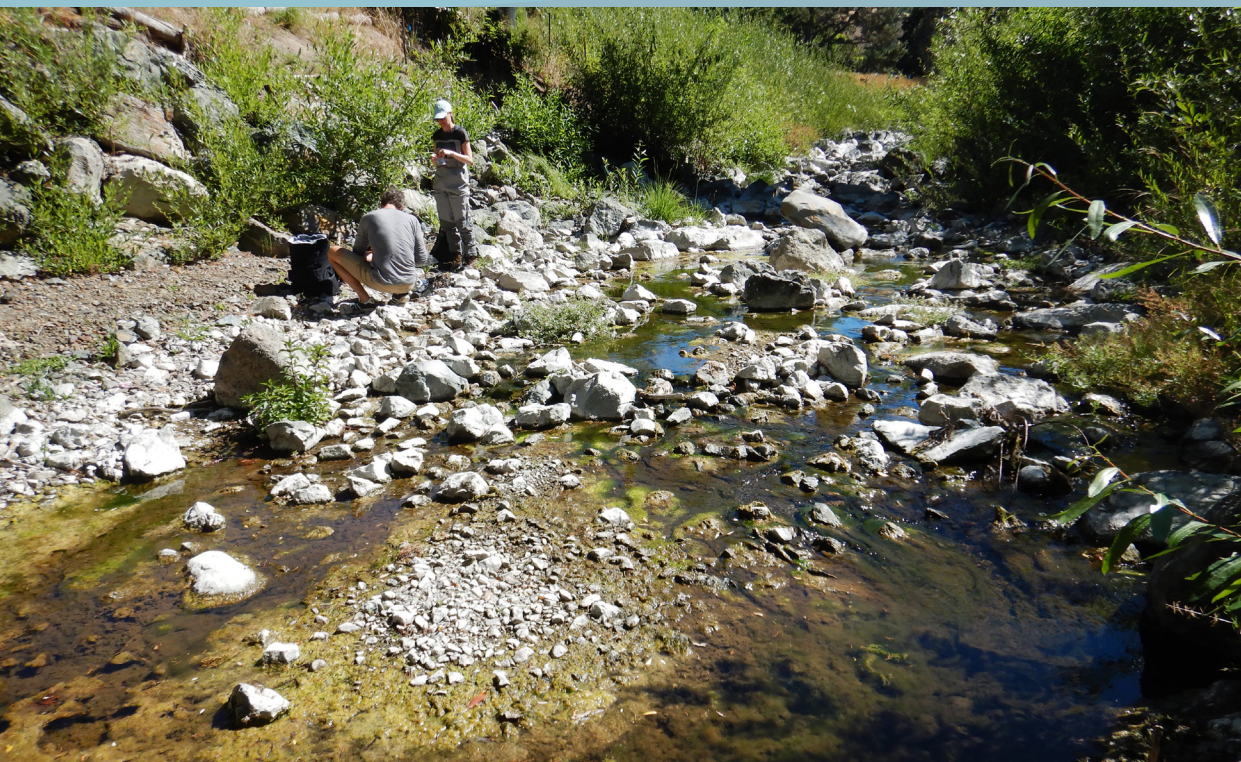
Photo to left: Staff from Surface Water Ambient Monitoring Program sample water temperature in Coyote Creek