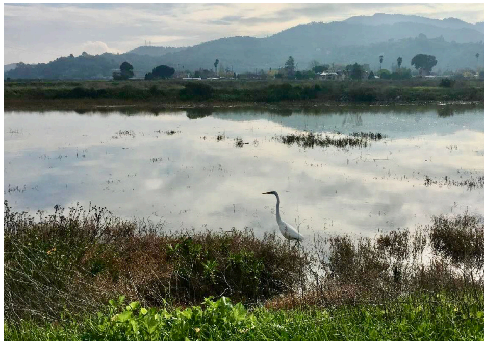
Photo to right: Gallinas Creek, inundated during a king tide, one of the many wetlands that will be monitored by the Wetland Regional Monitoring Program

In 2014, the State enacted the Sustainable Groundwater Management Act, requiring local agencies to develop thresholds and criteria for the priority groundwater basins to avoid degradation of water quality and surface water depletions. We evaluate groundwater conditions in our Region and recommend alternatives to address adverse impacts. This includes: 1) engaging local groundwater agencies and reviewing their groundwater management plans, 2) comparing current conditions to baseline, including assessing beneficial uses, supply well impacts, localized salt and nutrient areas of concern, and other water quality/habitat threats, and 3) documenting and sharing findings amongst our programs and with stakeholders.