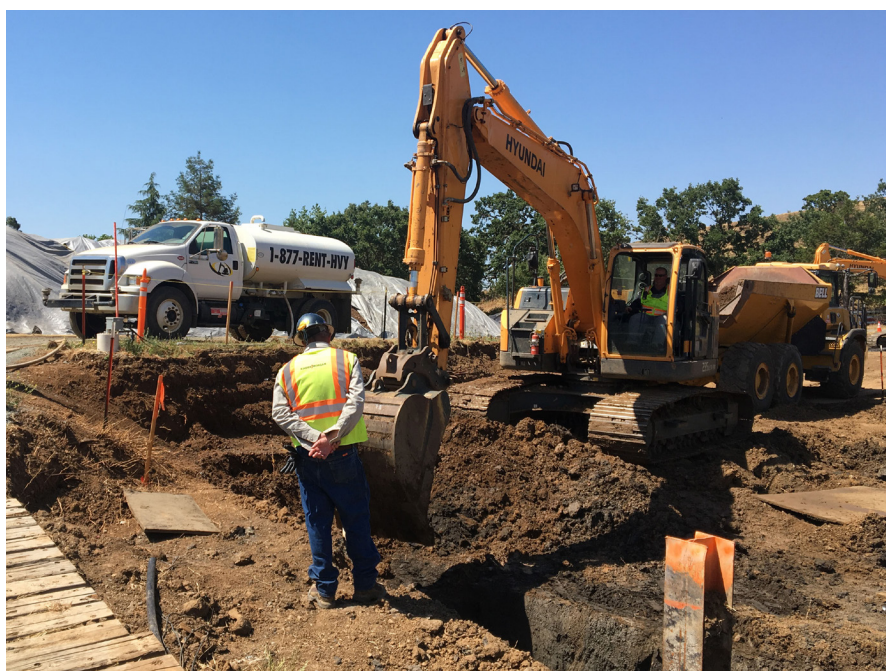
Photo below: Excavation at the Phillips 66 Line 200 site, a Site Cleanup Program site

Underground storage tanks (USTs) can leak petroleum and other hazardous substances into soil and groundwater, posing a risk to drinking water quality and human health. We oversee the investigation and cleanup of UST cases and support various local agencies that also oversee UST cases. We currently oversee 233 UST cases.