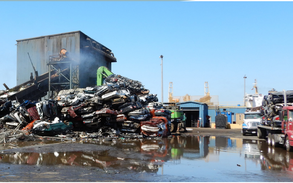
Photo to left: SIMS Metal Management Redwood City, a scrap metal shredding facility covered under the Industrial Stormwater Program