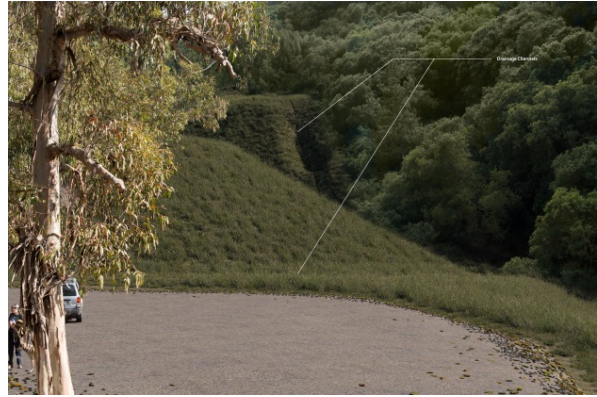
Image Set 2. View of Upper Mining Waste Pile, looking northeast from the McDonell Avenue cul-de-sac (approximately 200 feet back from images in Image Set 1).

The McDonell Avenue cul-de-sac will be expanded to use as a staging area during construction, which will also reduce turnaround time for emergency vehicles after construction. Stormwater run-on prevention ditches are called out (erosion control and slope stability features during revegetation) in project design.