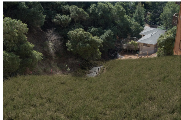
Image Set 3. View from the top of the Lower Mining Waste Pile, looking southwest and down, toward Leona Street (parallel to power lines at upper right).

The Lower Mining Waste Pile will be similarly stabilized and capped to isolate sulfur-bearing waste from water to eliminate acid mine drainage. The Leona Creek channel will be expanded to increase flow capacity and will be stabilized, utilizing a step-pool design with cascades, where necessary, in steeper areas. Runoff and creek water will run clear and water quality should improve vastly.