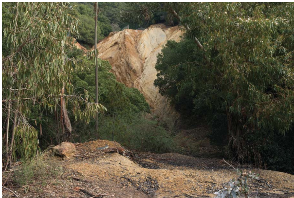
Current Condition Photos