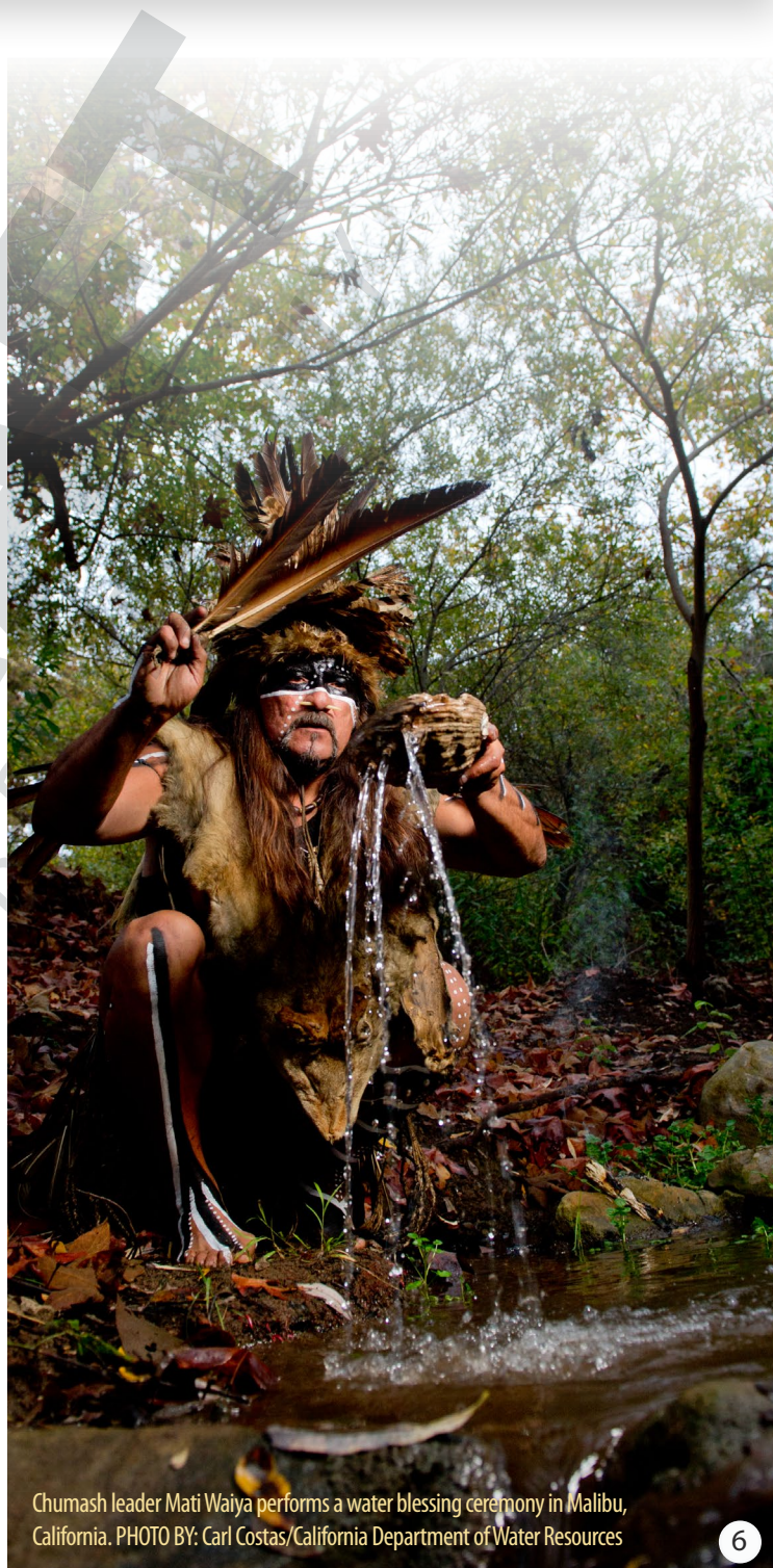
Chumash leader Mati Waiya performs a water blessing ceremony in Malibu, California.

Steps 1 through 3 can can be done at the same time.