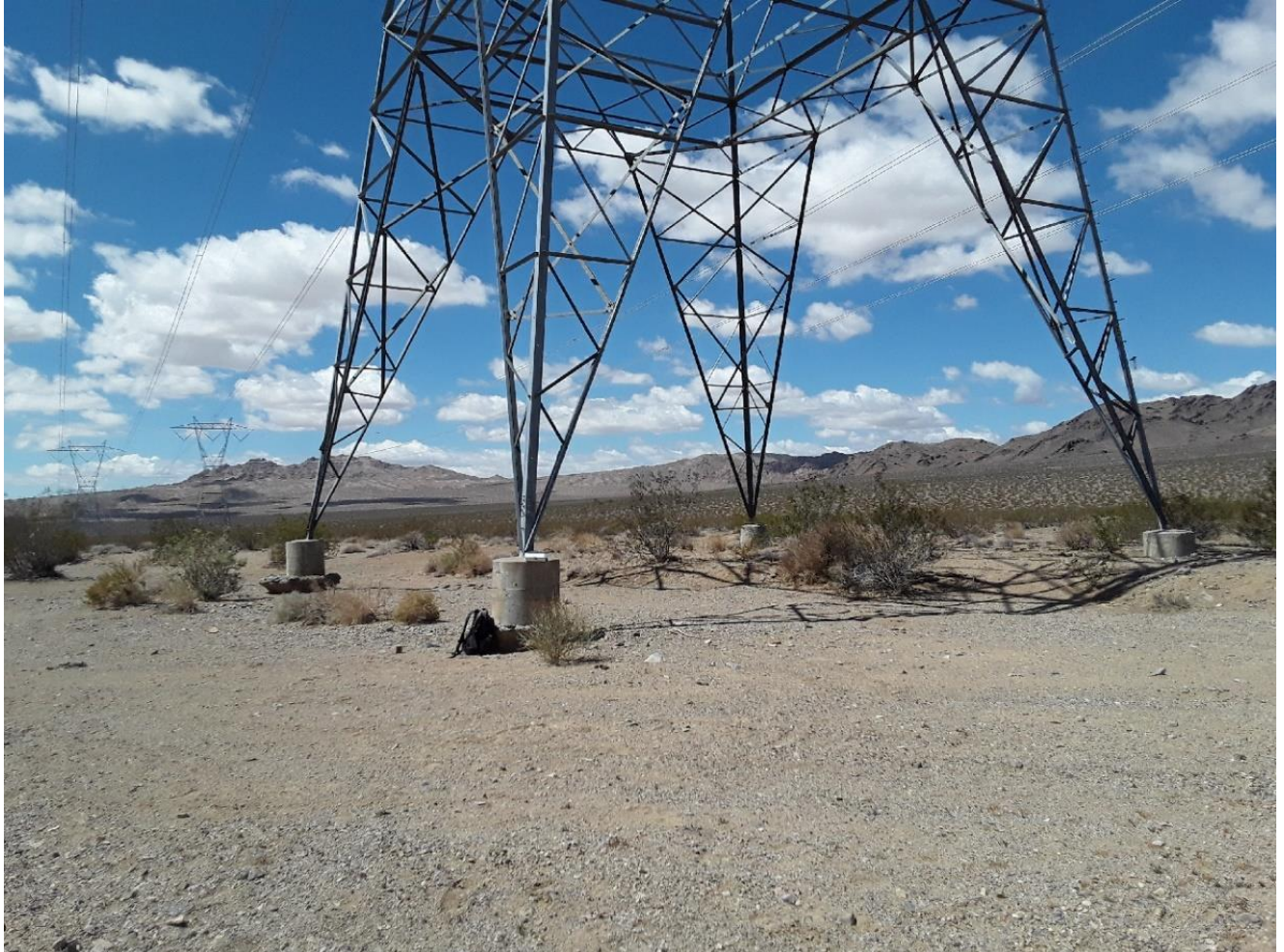
Photo 1: M42-T2 tower base footings in wash. Photo facing west, downstream.