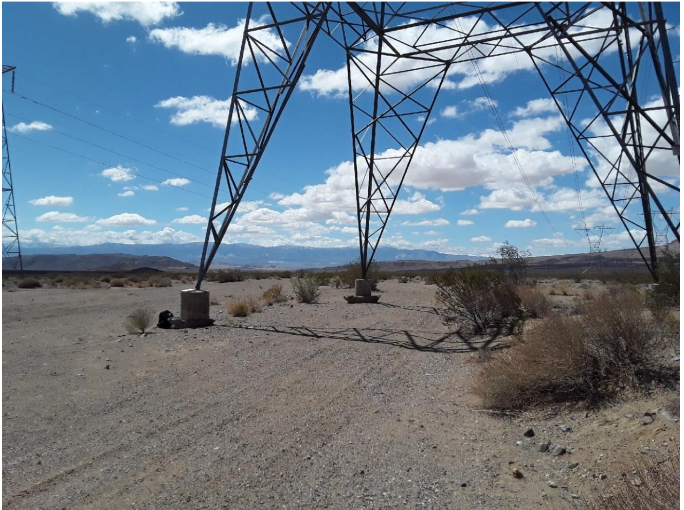
Photo 2: M42-T2 tower base footings in wash. Photo facing southwest, downstream.