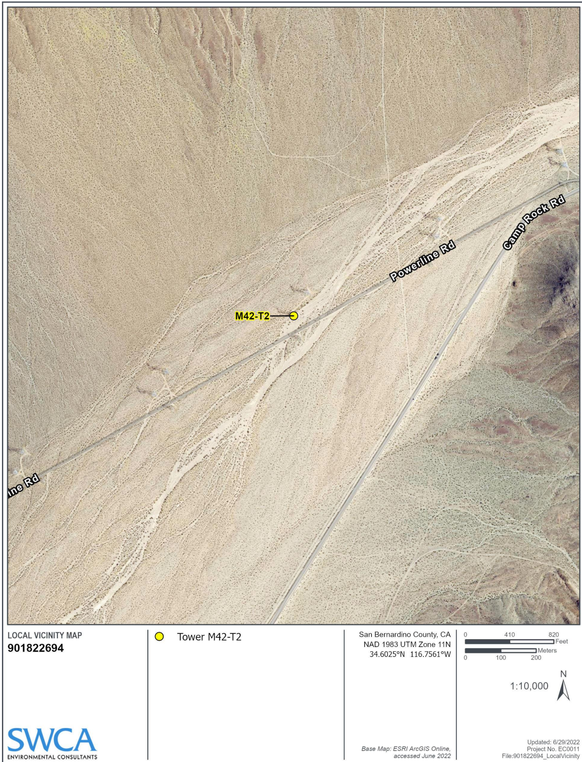
Figure 2: Project Location