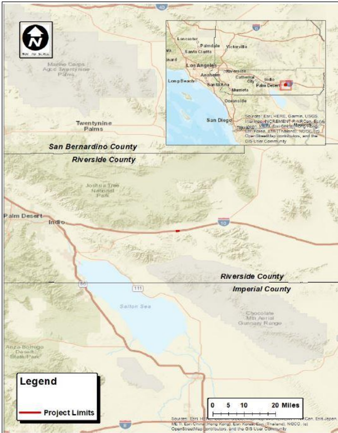
Figure 1. Project vicinity map (Caltrans, 2023 7 ).