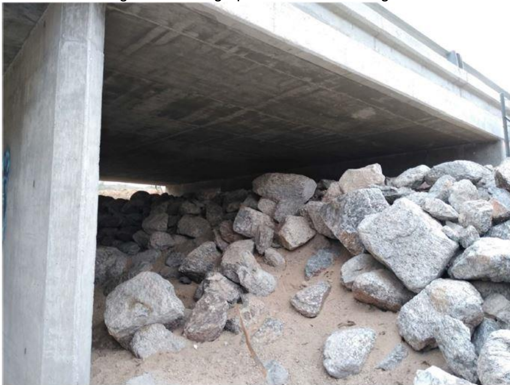
Figure 6. Photograph of bridge rock slope protection.