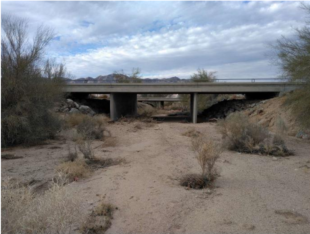
Figure 5. Photograph of Orris Ditch bridges.