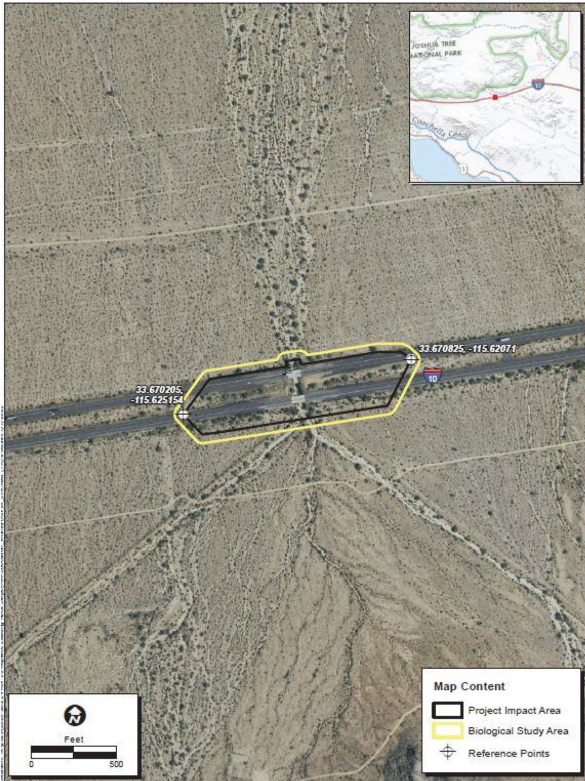
Figure 2. Project area aerial image.