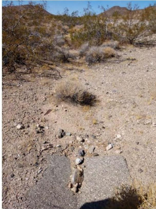
Photo 17: General view from within Project limits and non-jurisdictional concrete-lined v-ditch, facing west.