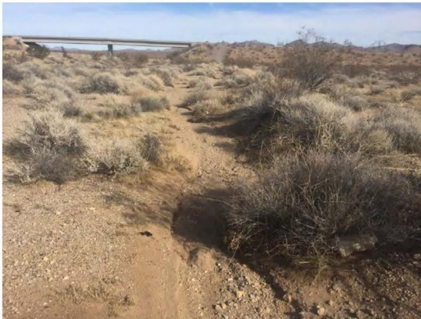
Photo 24: Proposed CDFW/RWQCB jurisdictional earthen drainage (Feature 13), facing east.