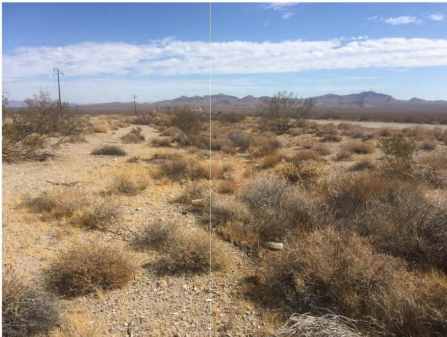
Photo 20: View of low point from within Project limits, facing east.