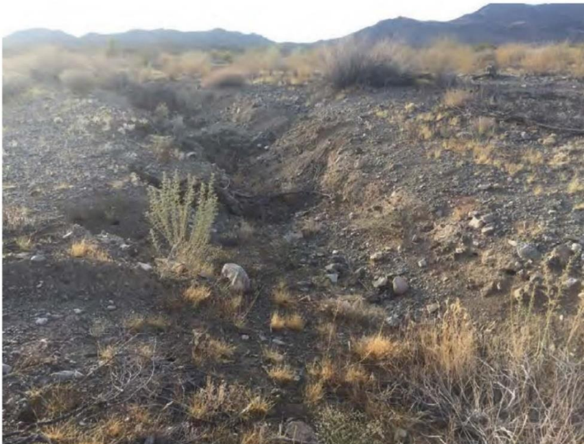
Photo 28: Proposed CDFW/RWQCB jurisdictional earthen drainage (Feature 16), facing south. (Caltrans, 2020)