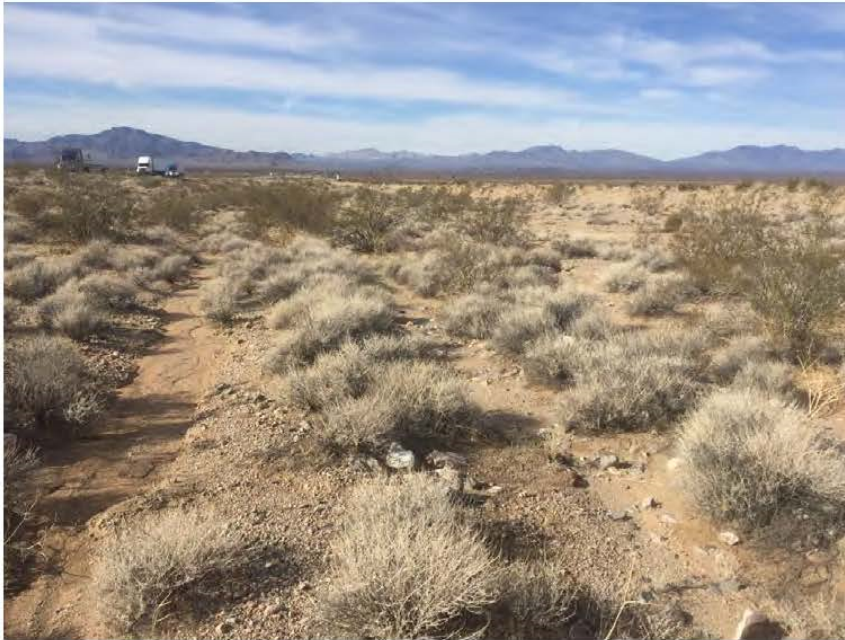
Photo 9: Proposed CDFW/RWQCB jurisdictional earthen drainage (Feature 9), facing west.