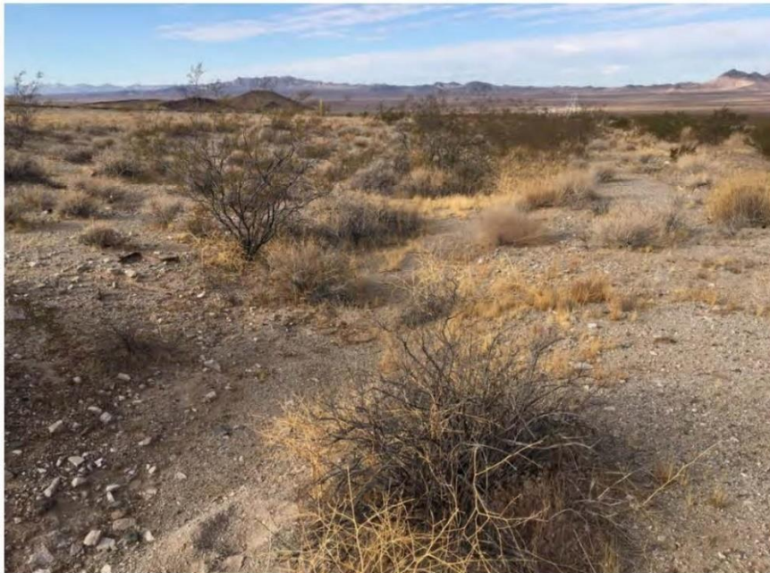
Photo 26: General view from within Project limits, facing west.