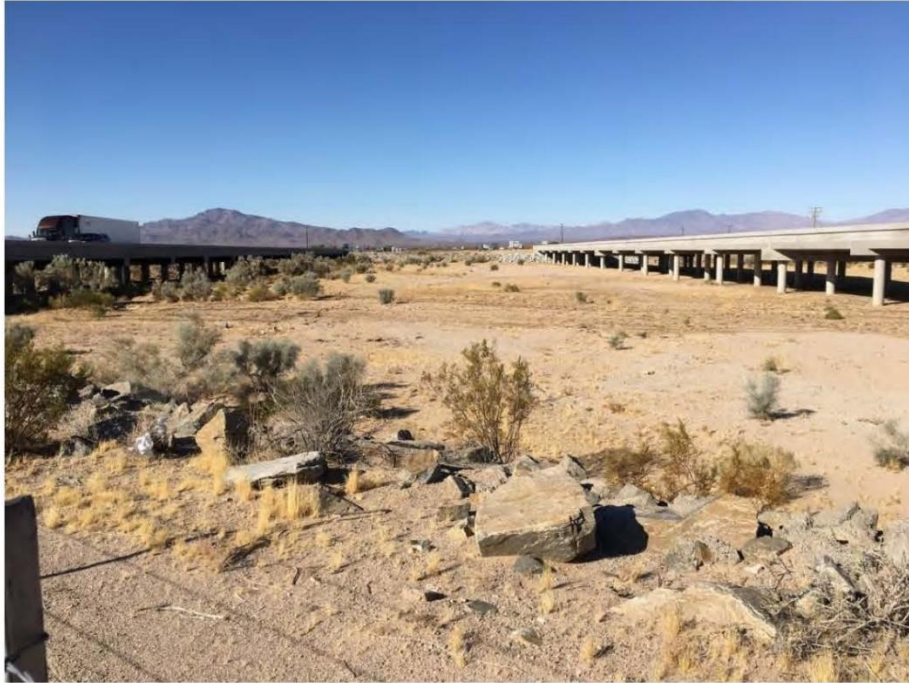
Photo 7: View of a proposed CDFW/RWQCB jurisdictional earthen wash (Feature 8), facing west.