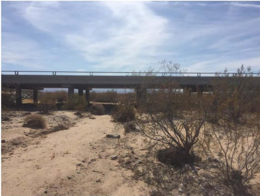
Photo 5: Proposed CDFW/RWQCB jurisdictional earthen wash (Feature 6), facing south.