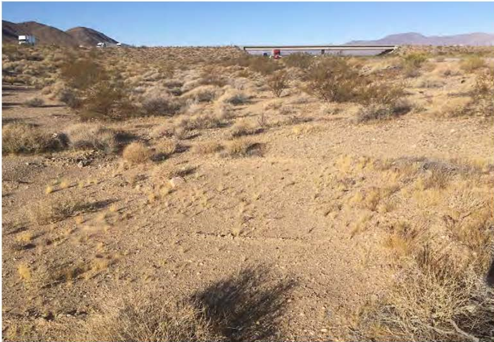
Photo 3: View within the median between I-40 eastbound lanes and on-ramp, facing west.