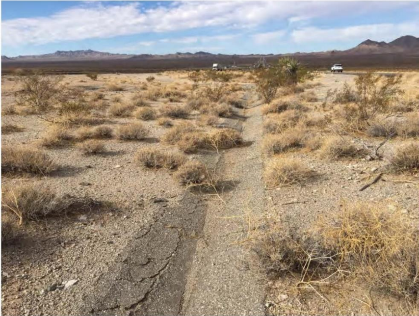
Photo 25: Proposed non-jurisdictional concrete-lined v-ditch, facing west.