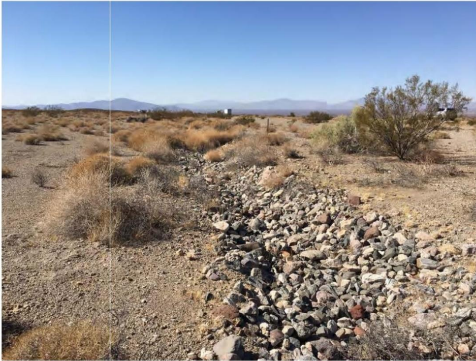
Photo 15: View of proposed non-jurisdictional rock ditch, facing west.