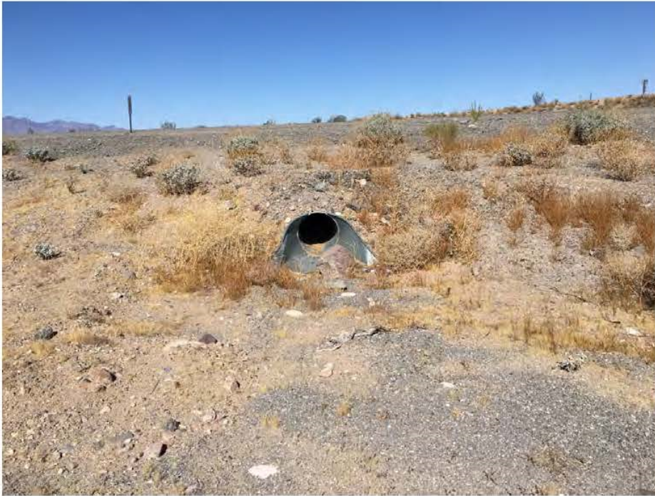
Photo 1: Culvert with no jurisdictional features. Westbound lanes in the background, facing north.