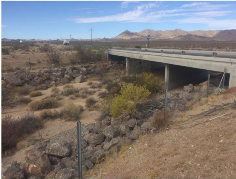
Photo 23: Proposed CDFW/RWQCB jurisdictional earthen wash (Feature 12) from the top of the slope, facing northwest.