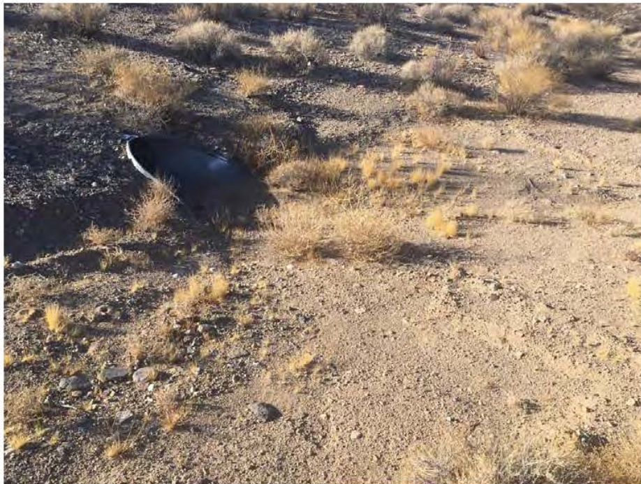
Photo 2: Culvert within the median between I-40 eastbound lanes and on-ramp, facing southwest.