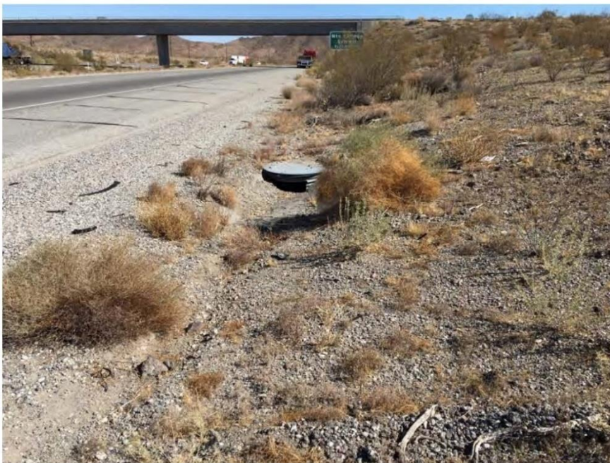
Photo 16: View of drain within Project limits and adjacent east-bound I-40 lanes, facing east. (Caltrans, 2020)