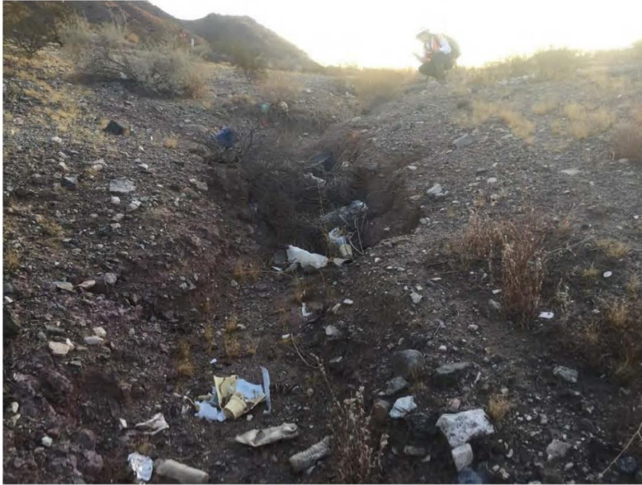
Photo 29: Proposed CDFW/RWQCB jurisdictional earthen drainage (Feature 17), facing southeast.