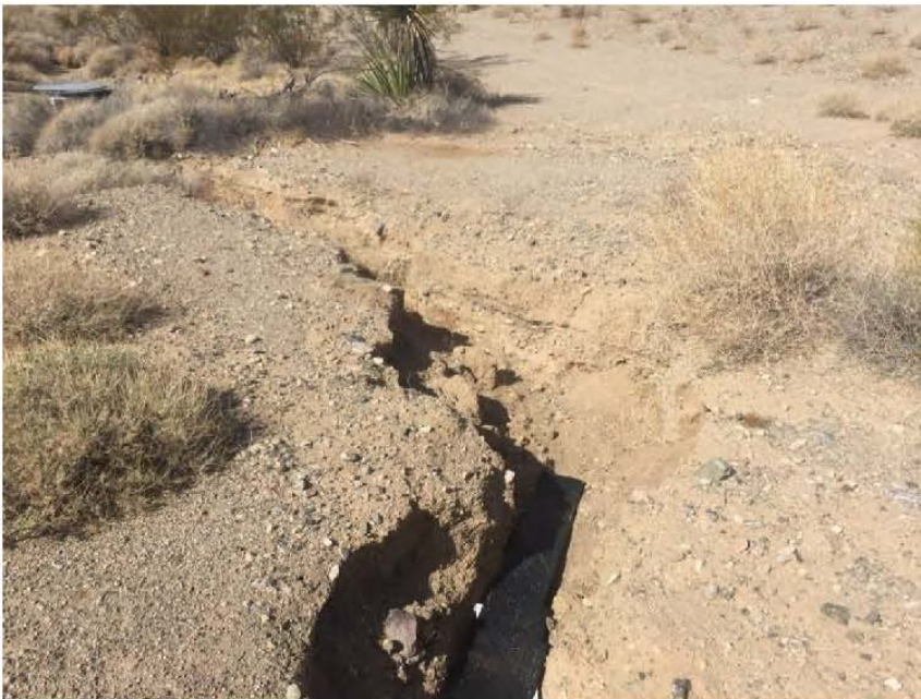
Photo 10: Proposed CDFW/RWQCB jurisdictional earthen drainage (Feature 10) leading into riser, facing west.