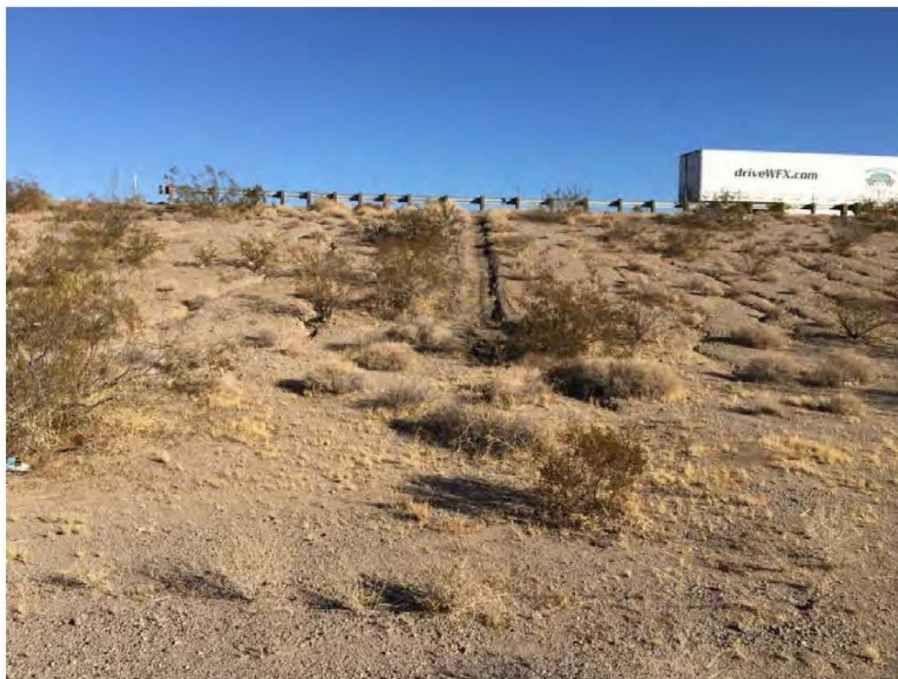
Photo 8: View of non-jurisdictional man-made v-ditch, facing north.