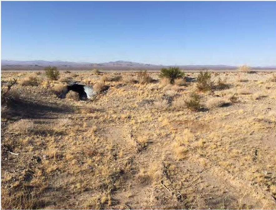
Photo 13: View of a culvert draining north underneath the freeway, facing north.