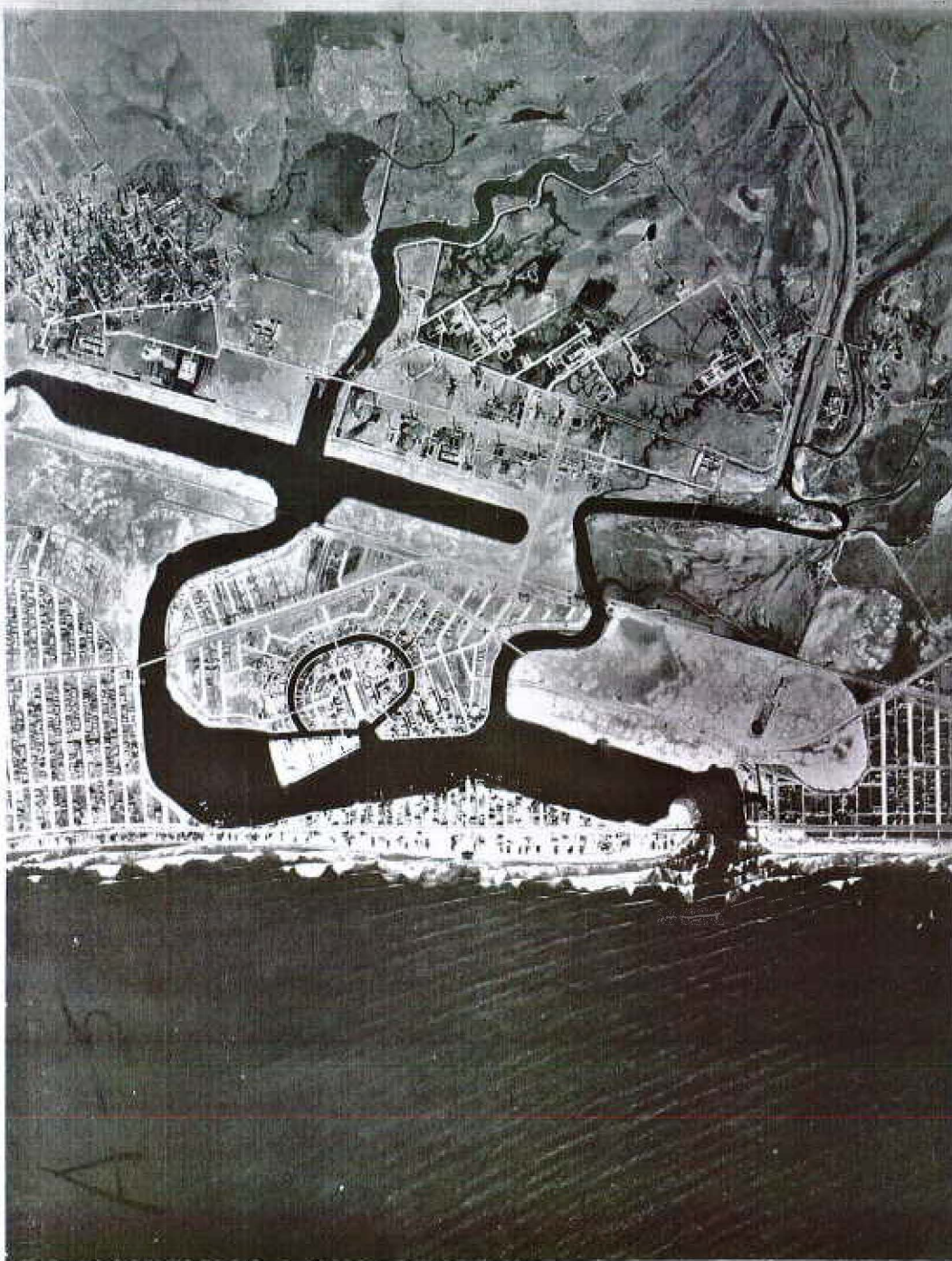
Figure 1. Alamos Bay in 1927, with recent diversion of the San Gabriel River from the Marine Stadium to Alamos Bay.