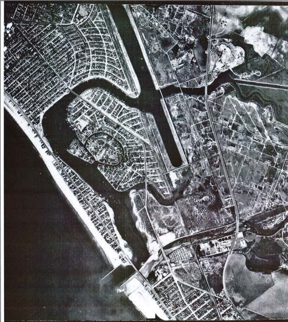
Figure 2. 1951 – The San Gabriel River silted up and jetties under construction at entrance to Alamitos Bay.