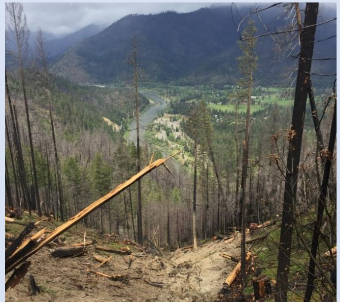
High intensity wildfire makes watersheds more sensitive to disturbance

The North Coast Water Board is the state regulatory agency with primary responsibility for protection of water quality in the North Coast Region. In that role, the North Coast Water Board issues permits for activities that have the potential to discharge pollutants, such as sediment, to waters of the state.