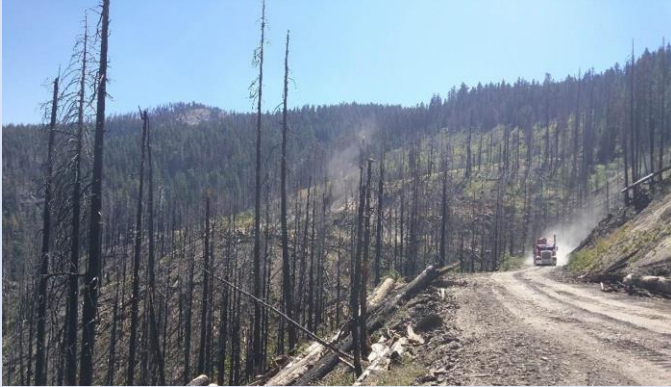
Post-fire Salvage must be conducted in a manner protective of water quality

Emergency Notices are automatically covered by the Categorical Waiver once CAL FIRE has accepted the landowner's Emergency Notice for the project. The North Coast Water Board's permits for timber operations are intended to ensure that projects are designed and implemented to prevent sediment discharges and retain trees that provide shade to streams.