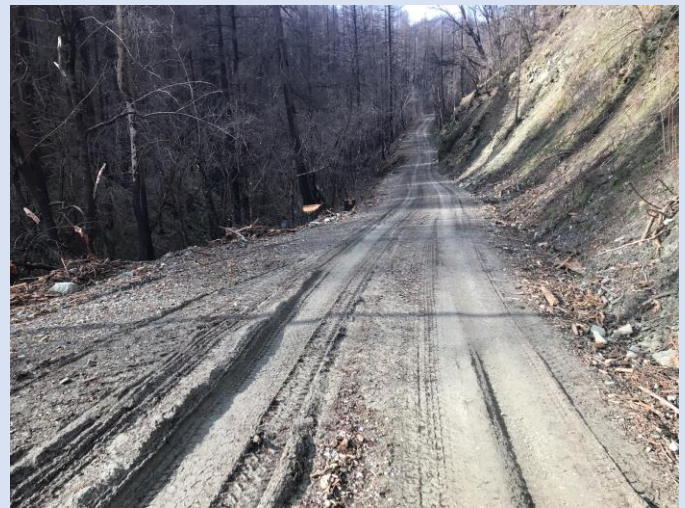
Roads like this one can contribute sediment to streams

The North Coast Water Board, in its role overseeing water quality, may inspect the project to ensure compliance with the General Conditions. These inspections may occur with or without CAL FIRE, but we provide at least 48 hours of notification beforehand. Where we observe a project that is not in compliance, we will engage with the landowner and their consultants to correct the noncompliance. Our engagement often will take the form of verbal or written recommendations advising the landowner on actions needed to protect water quality but, in some cases, could rise to a formal enforcement action.