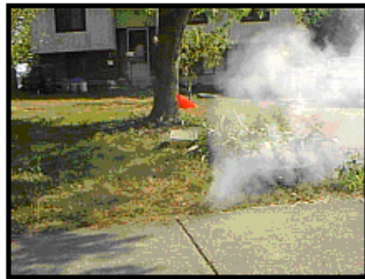
Figure 4.2. Smoke rising from a faulty lateral line.