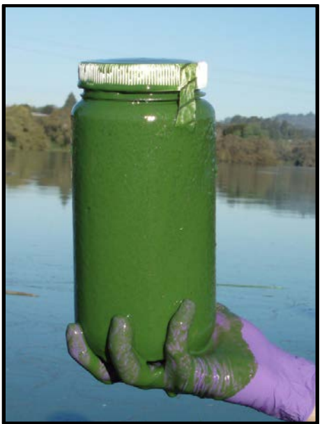
Pinto Lake water sample

California Environmental Protection Agency