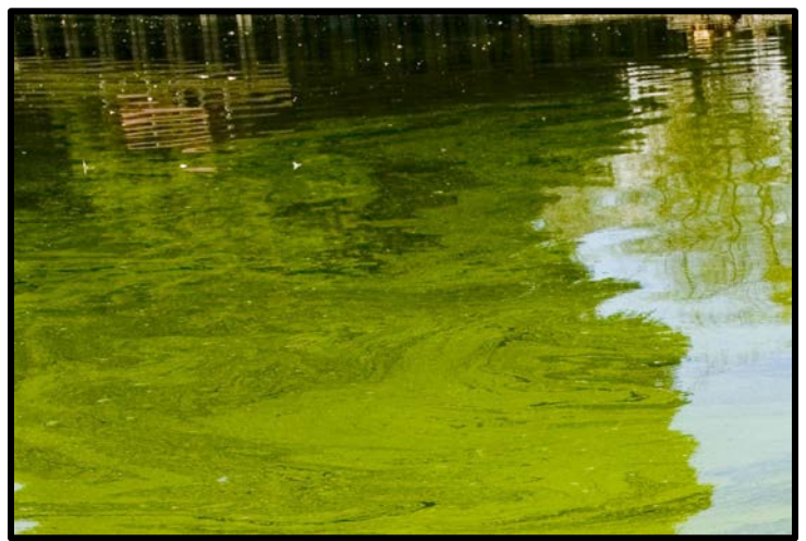
Pinto Lake algal bloom