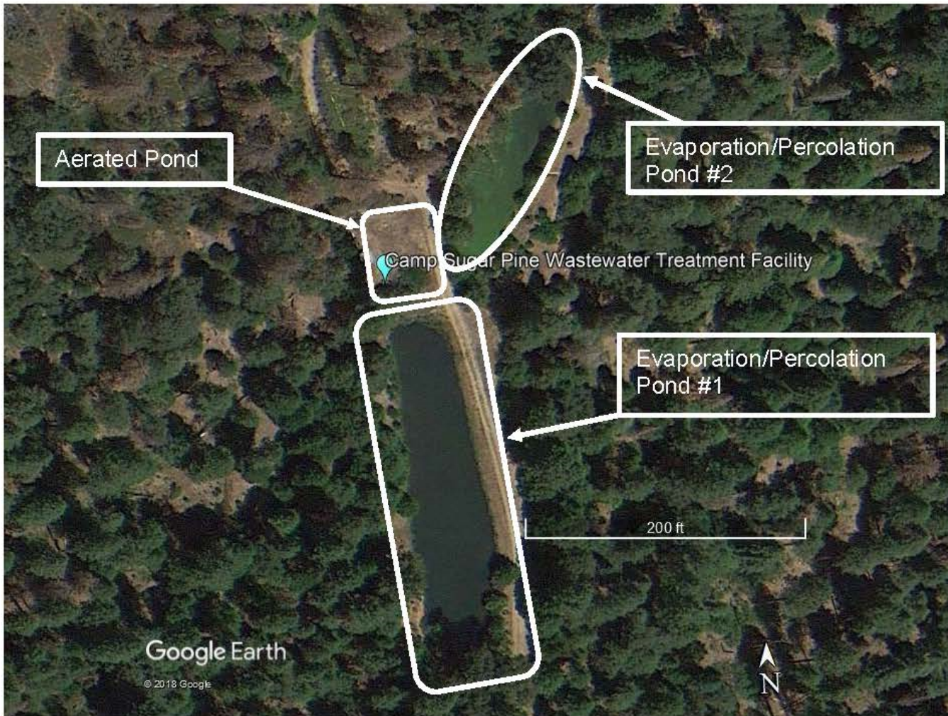
ATTACHMENT B – WASTEWATER PONDS MAP NOTICE OF APPLICABILITY 2014-0153-DWQ-R5340 FOR SUGAR PINE CHRISTIAN CAMPS CAMP SUGAR PINE WASTEWATER TREATMENT SYSTEM MADERA COUNTY