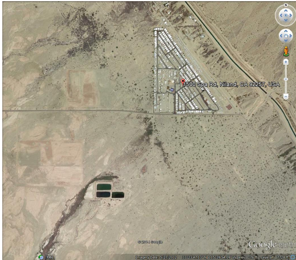
SITE MAP FOUNTAIN OF YOUTH SPA CORP, OWNER/OPERATOR FOUNTAIN OF YOUTH SPA DOMESTIC WASTEWATER DISPOSAL PONDS Niland - Imperial County