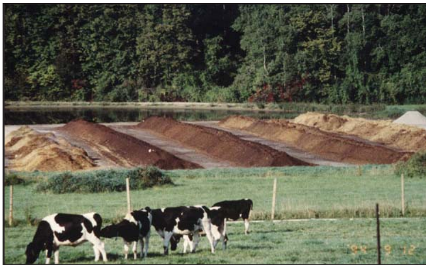
Cornell's compost site.

Good housekeeping at the site is important. There should be no ruts, standing water or garbage on the site. Site perimeters should be mowed to avoid contaminating piles with weed seed that will blow in. Good maintenance keeps the operation running smoothly.