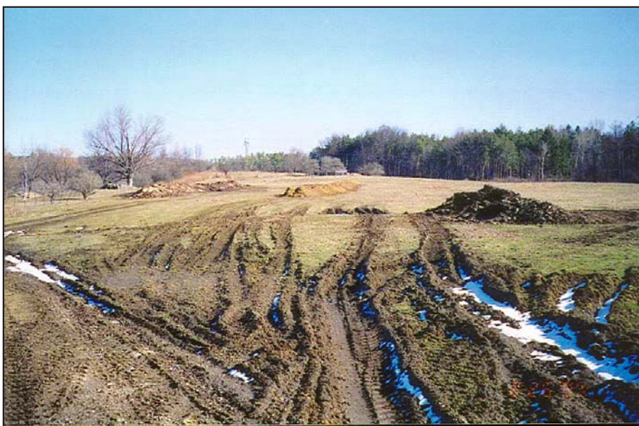
Site preparation avoids rutting.

Siting facilities well can also help to avoid water quality problems. A high water table may lead to flooding of the site which will make equipment access and operation more difficult. Flooding can also promote anaerobic conditions in the compost which may lead to malodors. A high water table or flow of surface water onto the site also increases the likelihood of leachate contamination of groundwater or nearby surface water. The shorter the distance leachate percolates through unsaturated soil, the less it undergoes natural biological and physical treatment. Moderate to good soil percolation rates are desirable to avoid standing water and to minimize leachate and runoff. Well-drained sites allow equipment to operate even in wet weather. County soil surveys that provide information on depth to groundwater, percolation rates, and soil types are usually available at the local office of NRCS.