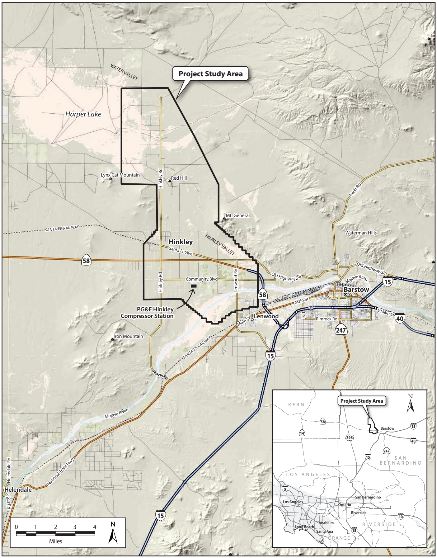
Figure ES-1 Project Location and Vicinity