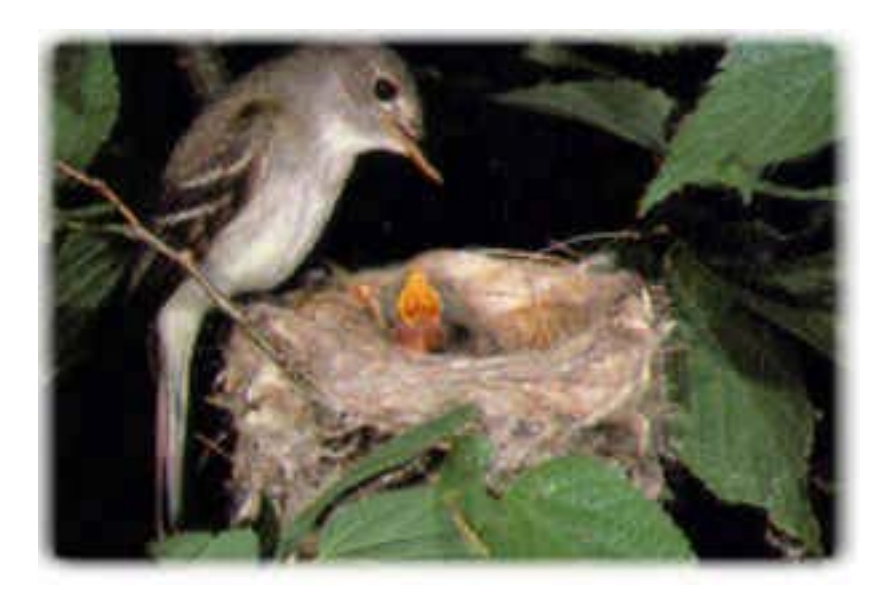
Figure BB . Flycatcher<sup>6</sup>

of its length, but children age 2 to 14 are regularly observed bathing in the Creek during hot afternoons. On a peaceful Sunday afternoon, families of ducks can also be observed frolicking at many points on the creek. The bicycle path, shaded in places by riparian trees, along the creek is used extensively.