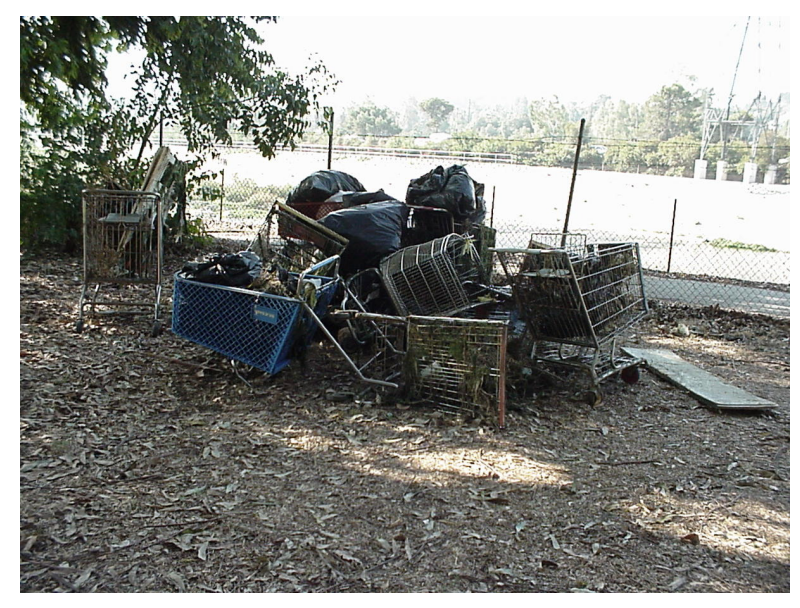
Figure D. Trash waiting for pick-up at Los Feliz Boulevard after the Sunday, October 16, 1999 river clean-up.

addition, volunteers traditionally focus on larger, more visible debris to the exclusion of smaller debris which are commonly encountered, such as cigarette butts.