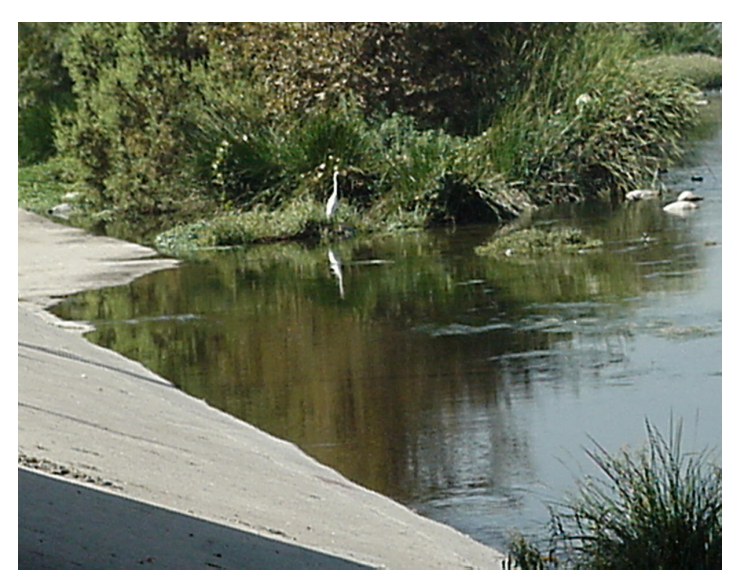
Figure C. Fletcher Drive: Great Egret, October 26, 1999.