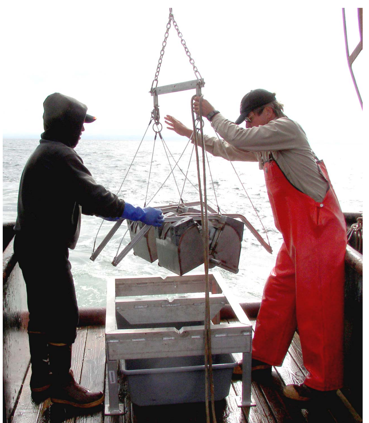
Figure 2. Double Van Veen Grab Sampler