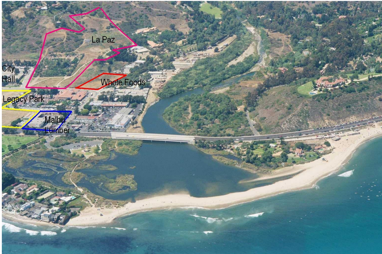
Figure 2: La Paz Oblique Location Photo