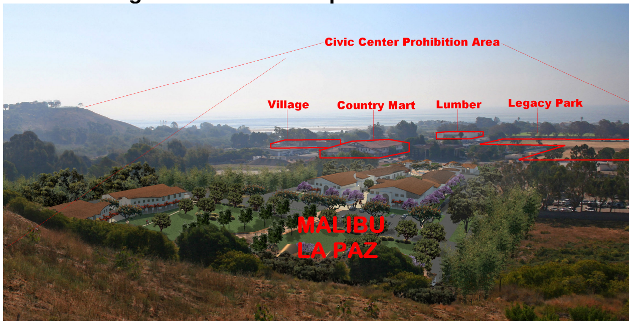
Map 1: La Paz