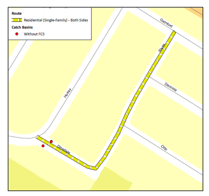
Figure 2. Low Density Residential Area Route. Collection occurred Tuesday. Route includes the side of the street swept Wednesday only.