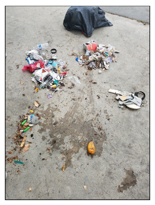
Figure 7. Sorted trash pile from the High Density Residential Area route on 7-25-17.