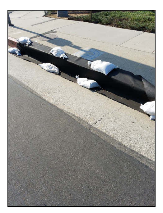
Figure 5. Catch basins along the study routes were covered to prevent trash from being swept into them.