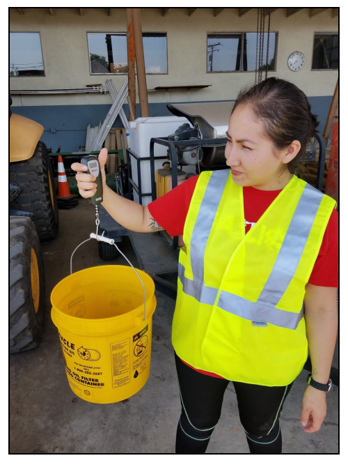
Figure 6. DGR crew member weighing collected trash using a digital scale.