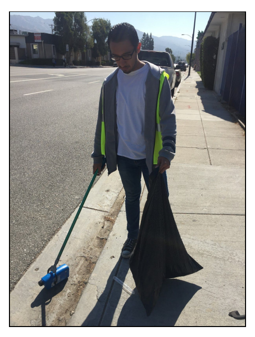
Figure 4. DGR crew member collecting trash using a reaching tool.

Figures 4-7 were taken during the 2017 DGR study. Each picture includes a brief description.