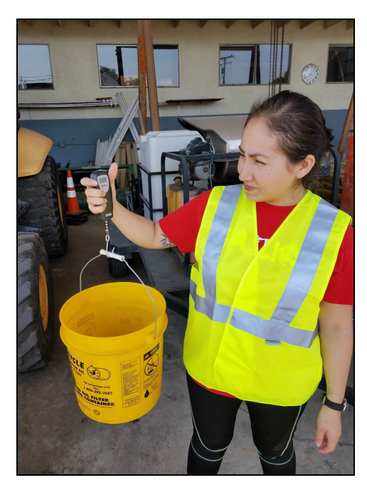
Figure 5. DGR crew member weighing collected trash using a digital scale.