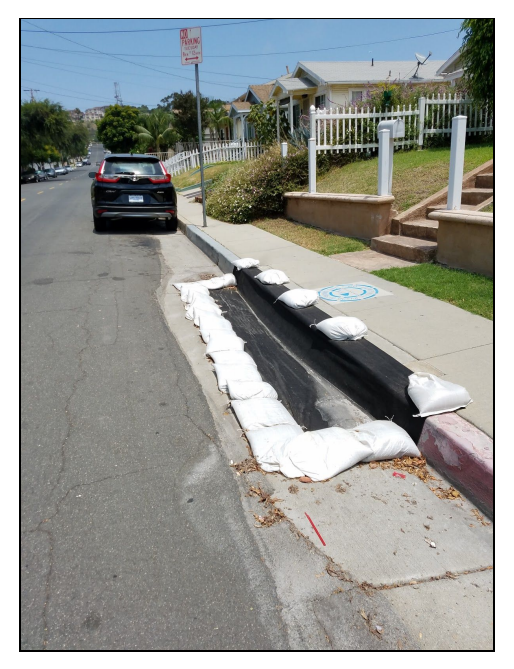
Figure 4. Catch basins along the study routes were covered to prevent trash from being swept into them.