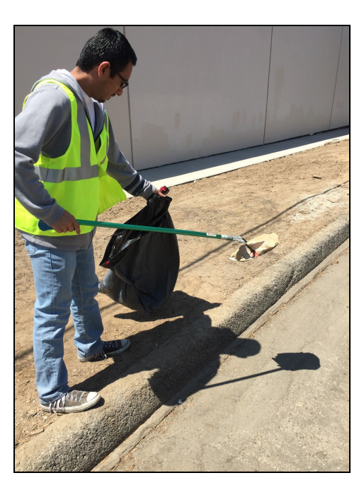
Figure 3. DGR crew member collecting trash using a reaching tool.

Figures 3-6 were taken during the 2017 DGR study. Each picture includes a brief description.