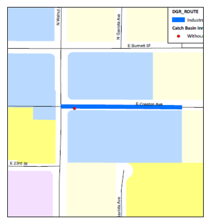
Figure 2. Industrial Area Route. Collection occurred Monday. Route includes the side of the street swept Friday only.