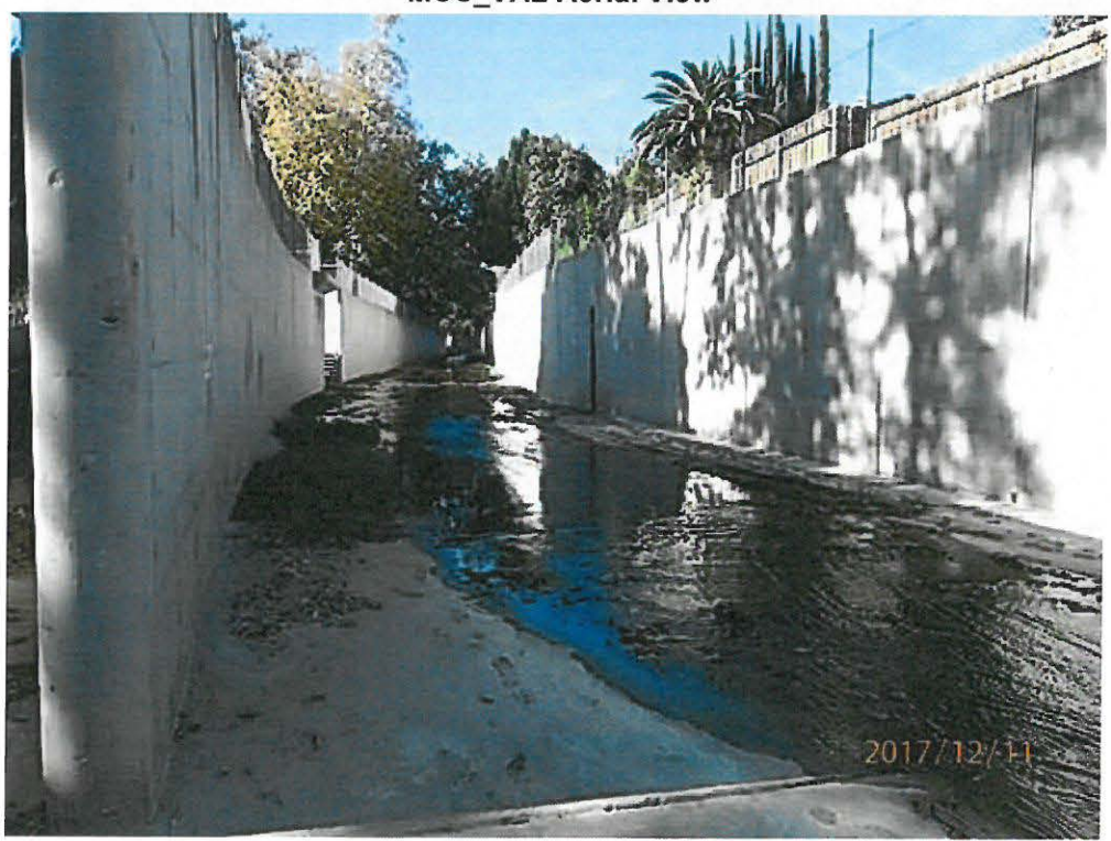
MCC_VAL Ground-Level View