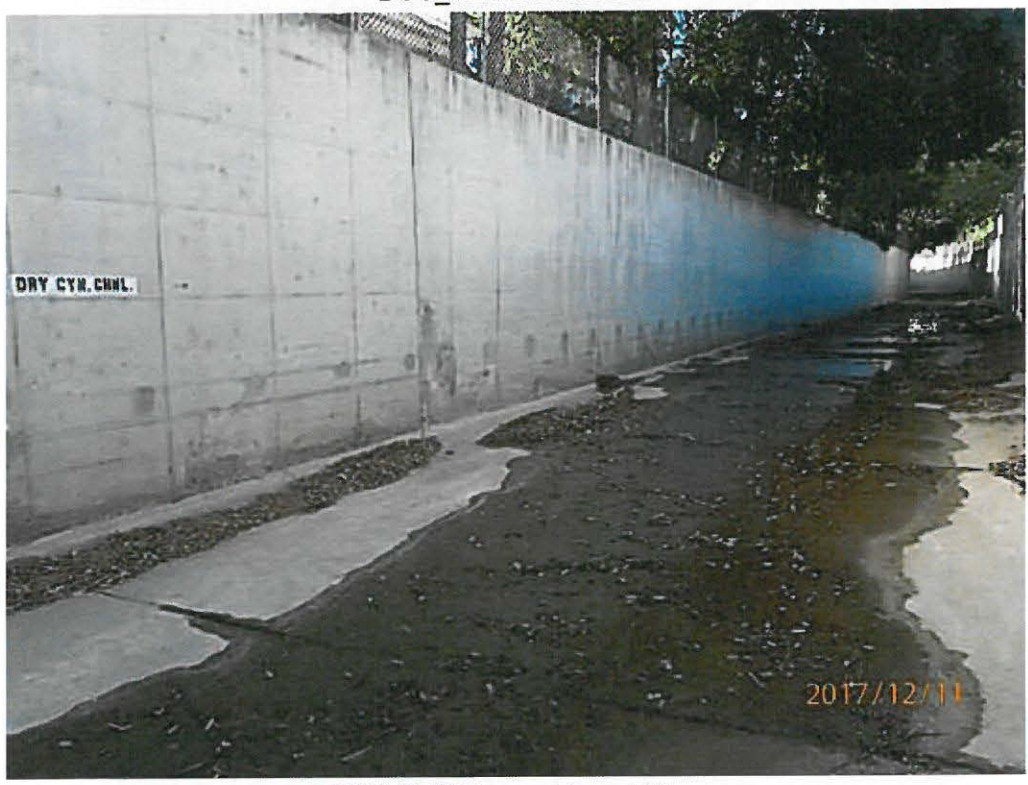
DCC_VEN Ground-Level View