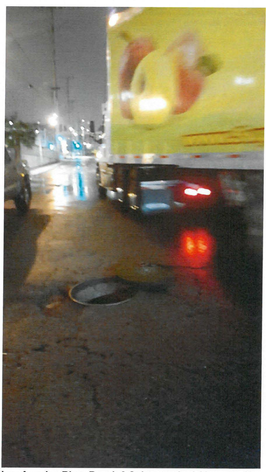
Los Angeles River Reach 2 Subwatershed Alternate Site