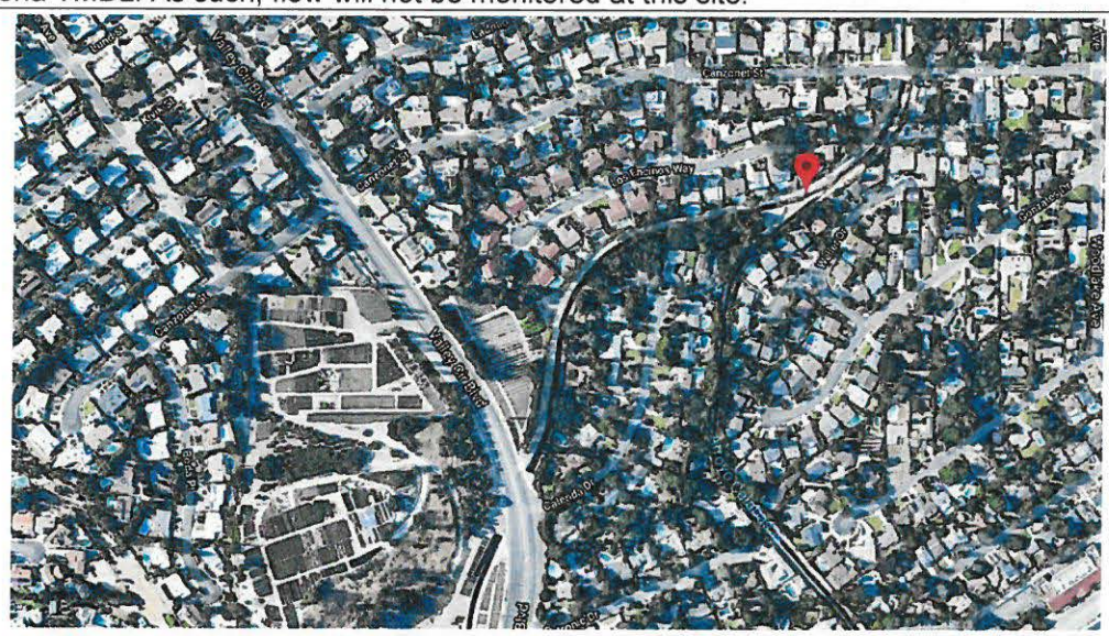
MCC_VAL Aerial View

General Description: Dry weather TMDL monitoring site located in McCoy Canyon Creek at Valley Circle Blvd. Initially, this monitoring site is only intended to be monitored to satisfy the requirements of the Bacteria TMDL. As such, flow will not be monitored at this site.