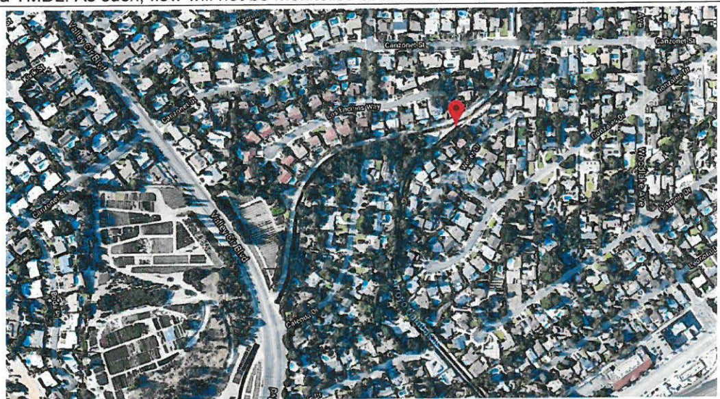
DCC_VEN Aerial View

General Description: Dry weather TMDL monitoring site located in Dry Canyon Creek at Ventura Blvd. Initially, this monitoring site is only intended to be monitored to satisfy the requirements of the Bacteria TMDL. As such, flow will not be monitored at this site.