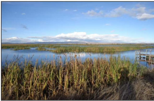
Walking wetland in Tule Lake Watershed.