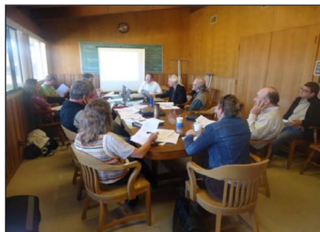
Humboldt/Trinity/Del Norte Advisory Group Meeting.

http://www.waterboards.ca.gov/northcoast/water_issues/programs/agricultural_lands/ .