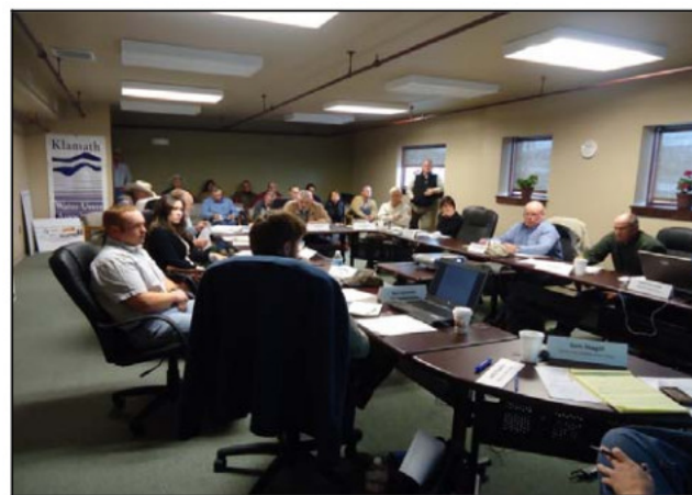
Tulelake/Butte Valley Advisory Group Meeting.