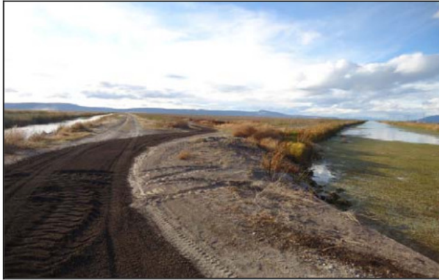
Irrigation drains and access roads in Tule Lake Watershed.

Highlights included the Lost River, the Tule Lake sumps, wildlife refuges, irrigation water supply canals, irrigation drains, water movement practices, farming practices, and the wetland restoration program known as walking wetlands.