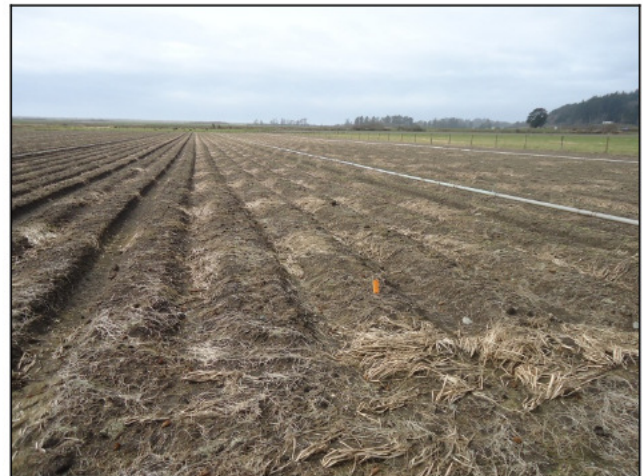
Lily bulb fields with straw residue check dams in the furrows, irrigation pipe, and rotational grazing field (on the far side of the fence).