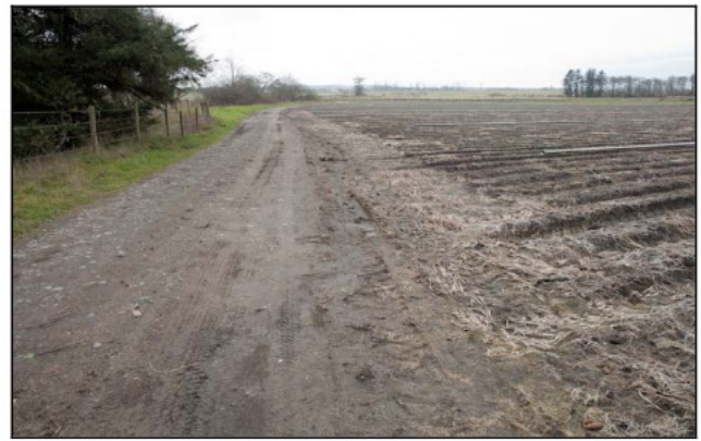
Lily bulb fields and tractor turn around area.

Members of the Easter lily bulb agricultural community also generously hosted a tour for Regional Water Board staff. Easter lily bulbs are grown in a small area of Del Norte County on the plain bordering the Smith River estuary. Highlights included a presentation on growing practices and timing, pesticide use, and monitoring history followed by a field visit of planted fields, rotational grazing fields, best management practices, and receiving water bodies.