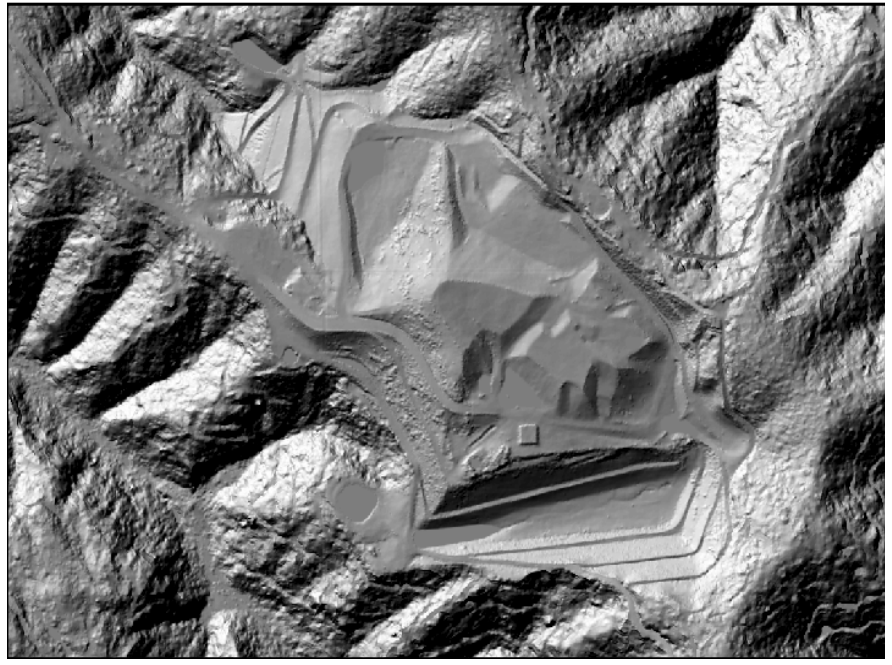
Figure 2. A shaded relief close-up of the Cummings Road Landfill as it appeared in March 2005 derived from the LIDAR DEM.