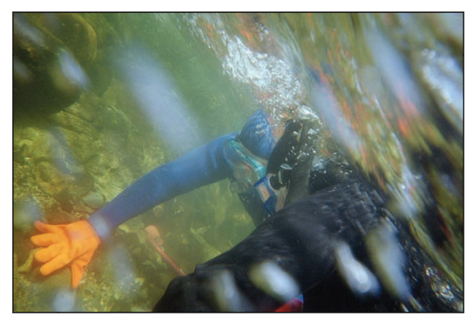
FIGURE 10: Under water diver searches for Mercury.

...REMOVING MERCURY WITH HAND-OPERATED SUCTION TUBES, OR BETTER YET, REPORTING HOTSPOT LOCATIONS TO LAND MANAGEMENT AGENCIES IS A BETTER STRATEGY.