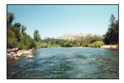
FIGURE 4: "The hotspot is located mid-channel in the South Fork of the American River, a few miles downstream from the Marshall Gold Discovery State Park at Coloma."

The hotspot is located on the downstream side of a low bedrock hump that extends across the river channel perpendicular to its flow. Because the hotspot remains underwater under all observed flow conditions, State Water Board skin divers recorded how the mercury occurred on bedrock and in river sediment visually. The bedrock hump is shaped like a low-pitched roof. River sediment forms wedge-shaped deposits on the up and downstream sides of the hump. Easily visible, small (e.g., 1mm)