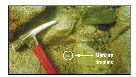
FIGURE 3: Under water photograph showing river sediment, bedrock, and mercury droplets.

Recreational gold dredging on public and private lands is a moderately popular activity in California. The Department of Fish and Game (DFG) issues several thousand permits annually to recreational gold dredgers. Along with gold, recreational dredgers recover iron (nails bolts, etc.), lead