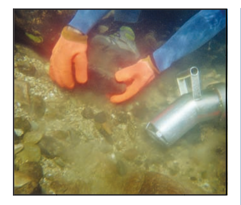
FIGURE 6. Dredging the hotspot.

The team performed the dredge efficiency test on Sept.15, 2003. The 63.5kg sediment sample used in the test had been collected by State Water Board staff from the hotspot and characterized for grain size and mercury content. State Water Board staff analyzed the sample's grain size at the Cal Trans Laboratory in Sacramento. The sample classifies as a "clean gravel with sand" under Unified Soil Classification System. Visual inspection of size fractions showed that almost all the liquid mercury rested in the fraction that passed a 30-mesh sieve (0.6mm). The mercury content of this fraction served as a surrogate for the mercury content of the entire sample. Chris Foe of the Central Valley Regional Water Quality Control Board had two 30-mesh passing fractions of the sample analyzed for mercury by ALS Chemex Laboratory in Reno, NV. Two suspended sediment samples of the bulk sample (i.e., samples of sediment that settled out of water used for sieving after