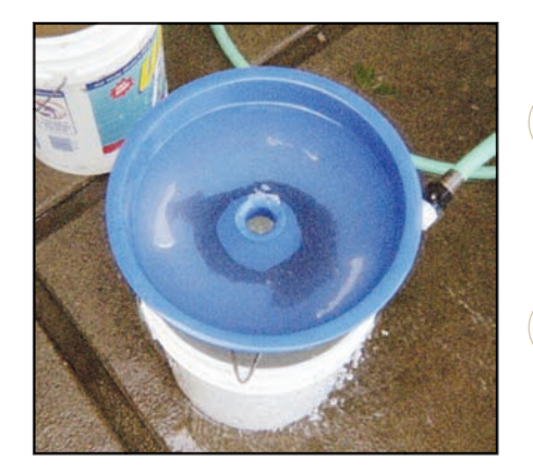
FIGURE 9. Liquid mercury (about 0.5kg) separated from sediment captured by the dredge.

6. The hotspot's effect on fish and invertebrates in this segment of South Fork of the American River should be determined.