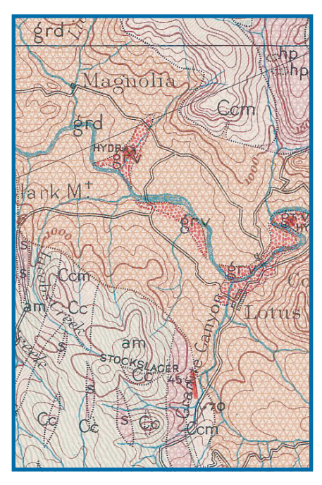
FIGURE 1: Historical Map of Coloma, California by Waldemar Lindren (1894), United States Geological Survey Folio#3 - Placerville, California, Economic Geology - northwest