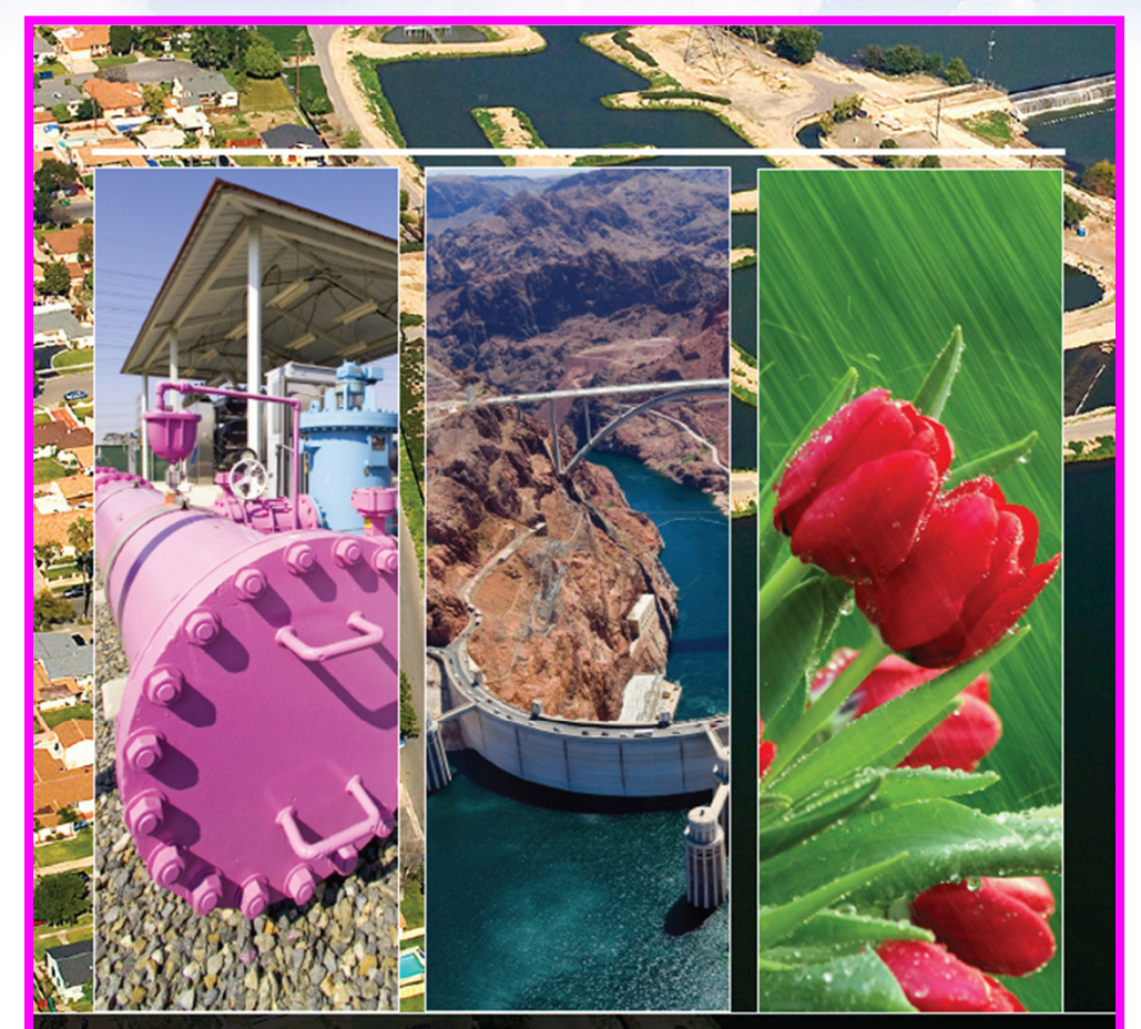
FINAL REVISED WORKPLAN Salt/Nutrient Management Plan

Central Basin and West Coast Basin Southern Los Angeles County, California