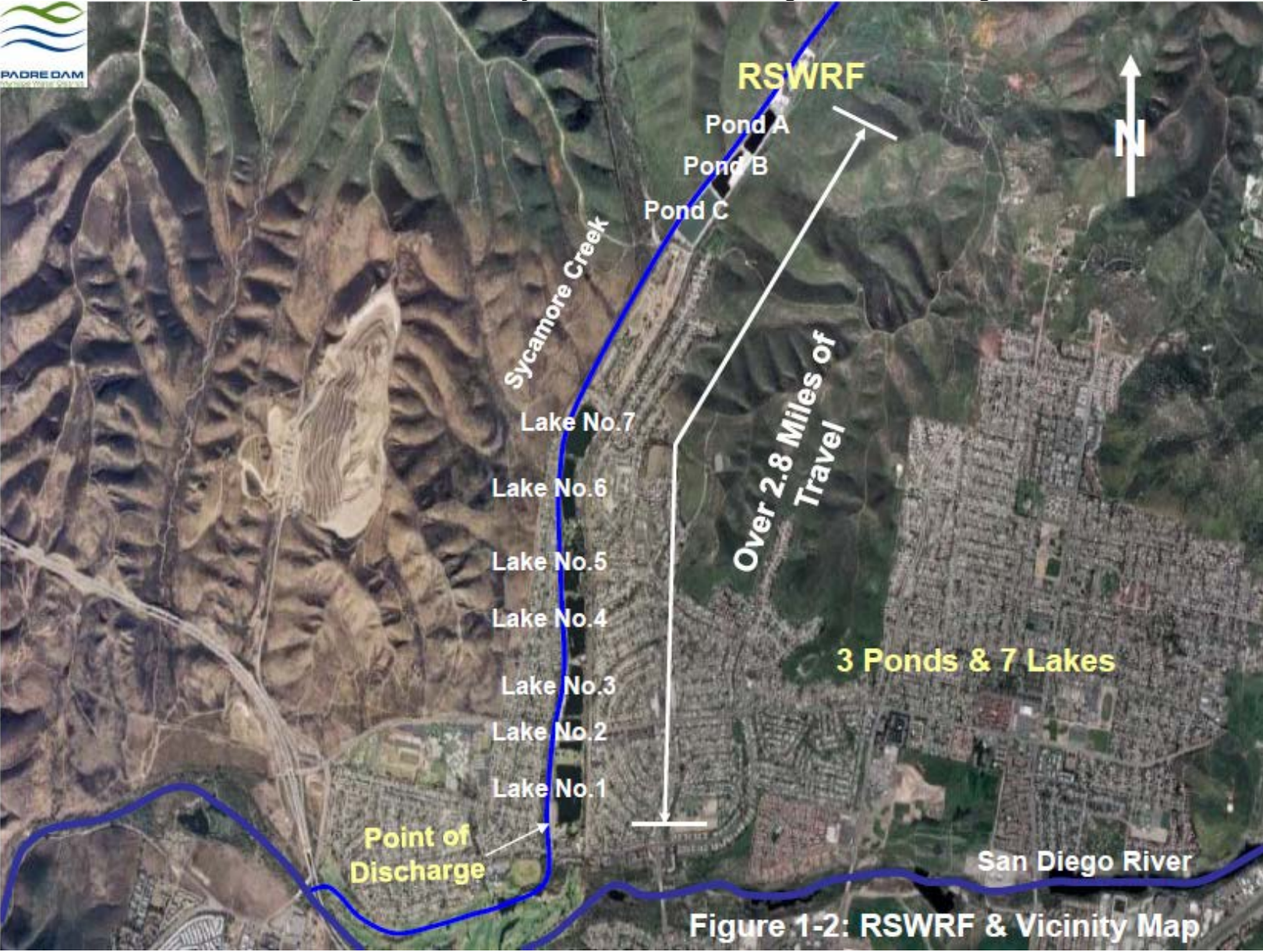
Figure B-2. Facility Location and Receiving Water Monitoring Stations