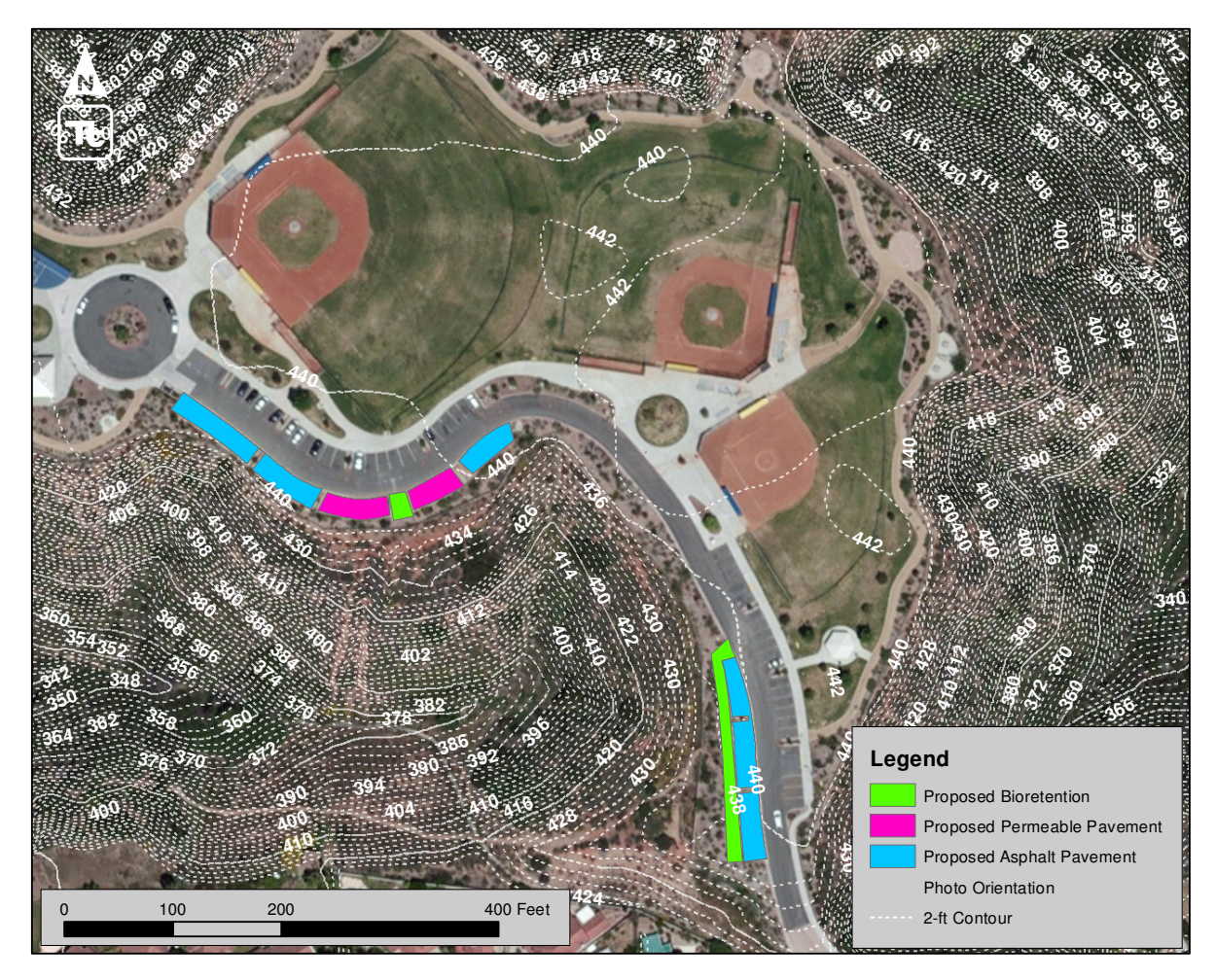
Camino Ruiz Neighborhood Park

Camino Ruiz Neighborhood Park - Camino Ruiz Neighborhood Park is located at the terminus of Camino Ruiz on the south side of Los Penasquitos Canyon in the Mira Mesa community. The park includes a mixture of pervious and impervious surfaces, rooftops, recreational facilities, and a parking lot. Only a minimal percentage of the site runoff is graded toward the current BMPs. Thus, the majority of the site runoff discharges untreated to the adjacent canyons. Two bioretention areas are proposed to provide treatment of runoff generated by the 85<sup>th</sup> percentile storm from the parking lot area. These facilities are proposed to be installed within existing landscaping areas. Additional storage is required to capture the 85<sup>th</sup> percentile runoff volume from the north side of the parking area and is proposed to be provided in permeable pavement parking stalls adjacent to the proposed bioretention area. The retrofit exceeds applicable regulatory requirements by treating runoff from impervious surfaces through bioretention to capture the 85<sup>th</sup> percentile storm runoff.