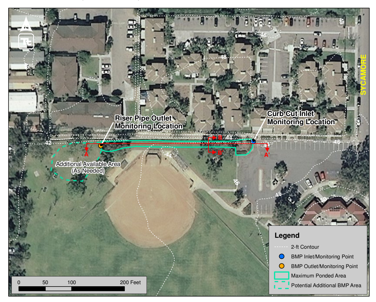
Cesar Chavez Community Center

Cesar Chavez Community Center – Cesar Chavez Community Center is located at 455 Sycamore Road, San Diego, CA, 92173. This facility was constructed prior to the 2001 storm water requirements and was not subject the storm water treatment requirements when it was built; therefore this project is proposed for additional water quality mitigation. The City proposes to retrofit the site by adding a hydromodification BMP in the grass and shrub area adjacent to the northwest corner of the parking lot extending west behind the baseball field and using the open space in the northwest corner of the park. The BMP is intended to divert storm water runoff from approximately 3.31 acres of drainage area, encompassing the community center parking lot, the north half of the building, and the multi-family residential units near the northeast corner of the parking lot. This BMP is proposed to be a hydromodification basin to exceed water quality and flow control standards. The retrofit will treat runoff from 144,184 square feet of impervious surface.