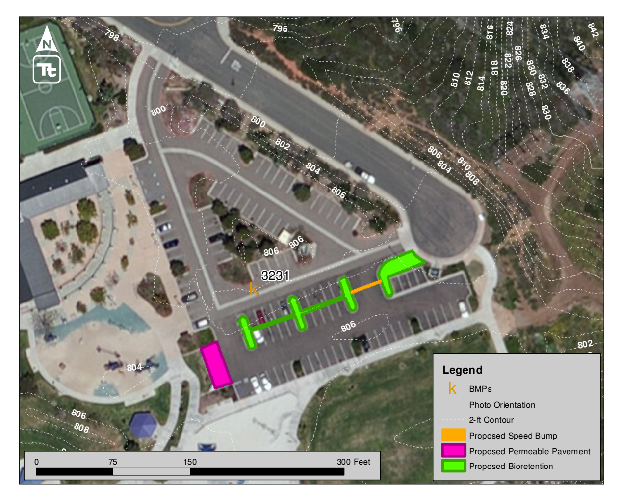
Hilltop Community Park

Hilltop Community Park - The Hilltop Community Park is located at the terminus of Oviedo Way in the Rancho Penasquitos community. The park, which is part of the Los Penasquitos watershed, includes a mixture of open vegetated area, impervious surfaces and rooftops, recreational facilities, and a parking lot. No BMPs are present in the parking lot expansion area of the site which is the focus of the retrofit. Proposed BMPs recommended for this site are proposed to provide treatment of the 85<sup>th</sup> percentile storm, well above the treatment requirements specified in the WQTR. Two bioretention facilities are proposed to provide for treatment of the majority of the study area. An existing landscaped area near Oviedo Way is proposed to be converted to a bioretention area along with the conversion of three landscaped areas within the existing parking lot area to bioretention areas. The parking lot bioretention areas are proposed to be linked by a narrow bioswale between parking stalls. Additional treatment is proposed to be provide through the conversion of 5 parking stalls to permeable pavement. The retrofit exceeds applicable regulatory requirements by treating runoff from impervious surfaces through bioretention to treat the 85<sup>th</sup> percentile storm runoff.