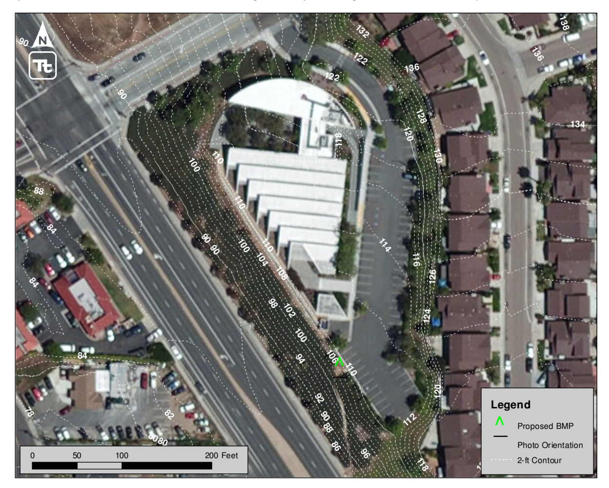
Otay Mesa/Nestor Library

Otay Mesa / Nestor Library - The library project site consists of a 5,000 square foot building expansion and a 4,600 square foot parking lot expansion. The composite site consists of 24,100 square feet of parking space and 28,100 square feet of additional building and sidewalk impervious areas. Because the building addition and additional parking was an expansion to an existing site, stormwater treatment was only required for the 9,600 square feet of additional impervious surfaces. Currently, there is a vegetated swale along the perimeter of south end of the parking lot for a large portion of the overall parking lot runoff to be treated. Because of the limited space available at the site and geotechnical issues associated with the proximity to steep slopes, it is recommended that a Filterra type or approved equivalent treatment unit be retrofitted to treat flows from the 85<sup>th</sup> percentile storm. The retrofit exceeds applicable regulatory requirements by treating runoff from 11,800 more square feet of impervious surface than the initial site design and by treating flows from the 85<sup>th</sup> percentile storm.