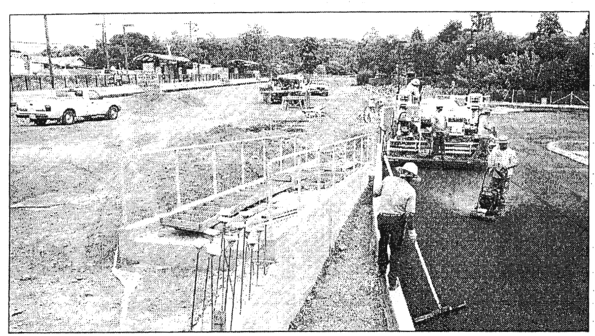
The parking lot near the Buena Creek station in Vista was paved as the transit district gears up for the Sprinter's planned opening around the end of the year. The district was fined for 16 runoff violations, two of which were in Vista.