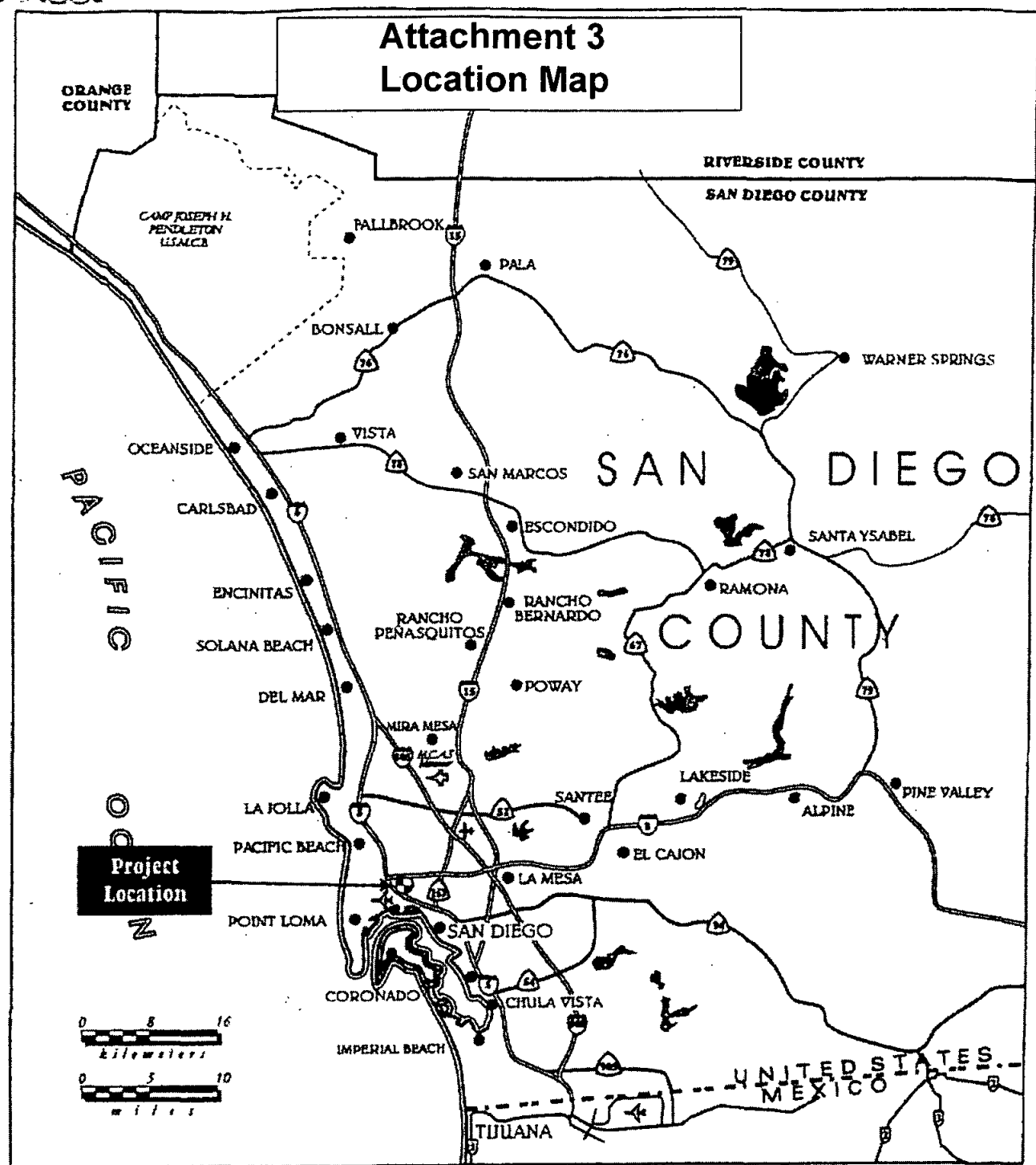
Figure 1 Regional Location Map