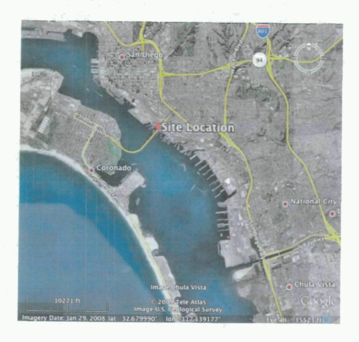
Figure 1. Location of Continental Maritime Pier 6 Dredging Project, Central San Diego Bay, CA.