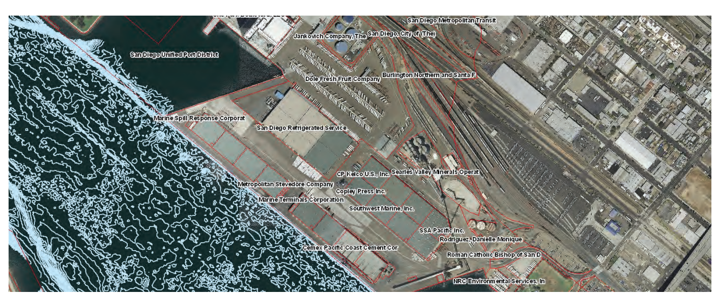
With GIS, the Port of San Diego can efficiently manage assets located on 6,000 acres surrounding San Diego Bay in California.