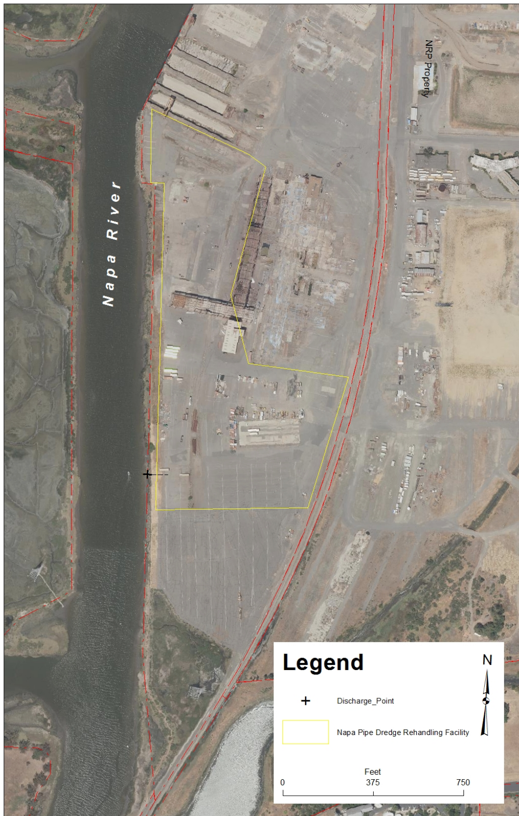
Figure 3. NRP Site Plan