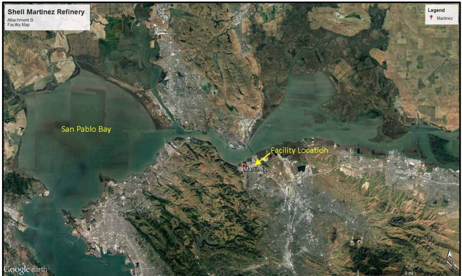
Figure B-1. Facility Location Map