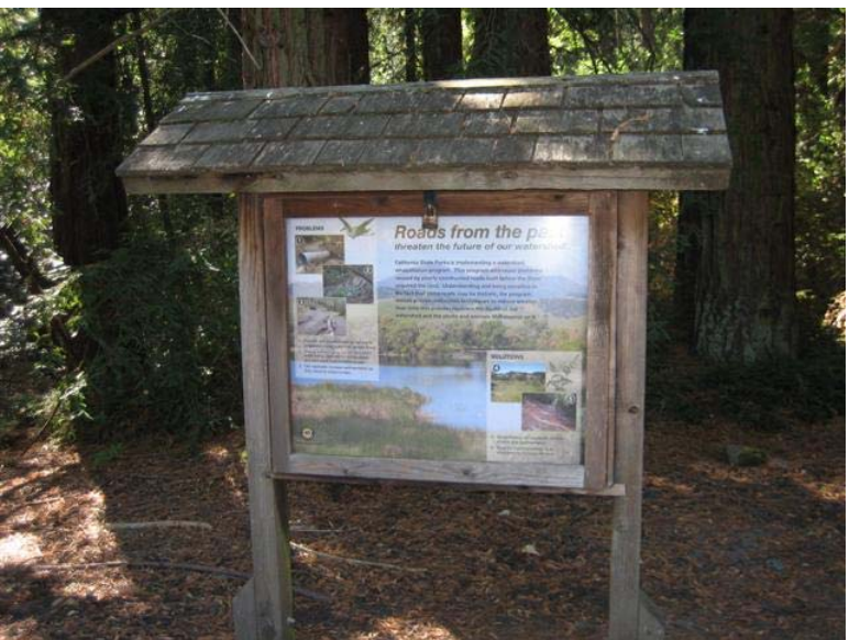
Fig. 2. Interpretive Sign at Trailhead on Road Rehabilitation Project at Jack London State Historic Park.

The results of the project included grading 3 miles of new roadbeds on improved alignments to reduce erosion, re-contouring the Treadmill Trail backcountry access road,