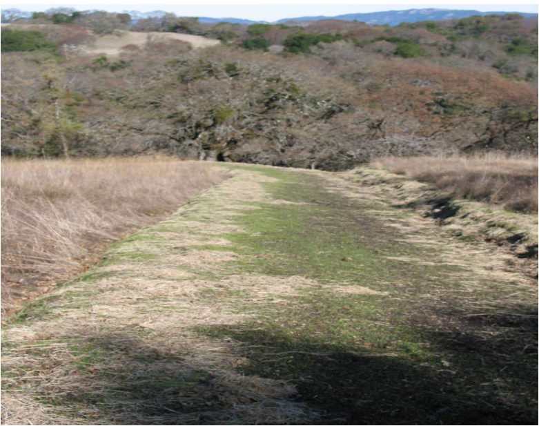
Figure 3. Re-contoured Roadbed. Erosion Control Materials Placed and Grass Cover Growing.

Becca Lawton Geologist, Research Program Manager Sonoma Ecology Center 20 East Spain Street Sonoma, CA 95476 707-996-0712, x116 becca@sonomaecologycenter.org