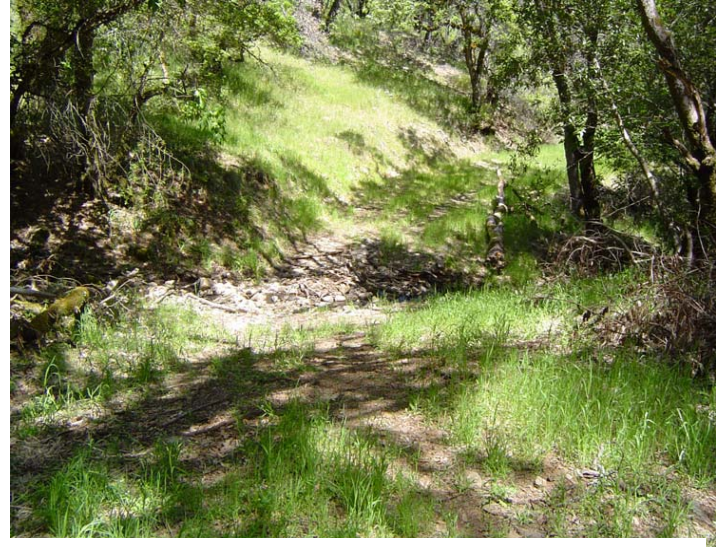
Figure 1. Trail Reconstruction – Some Erosion Problems Due to Heavy Rainfall in First Year.

degraded and compacted, were constructed for previous mining, farming, and fire access. Many of these roads crossed streams with culverts surrounded by unconsolidated fill. These roads and their stream crossings created a seasonally chronic source of sediment pollution into tributaries of Sonoma Creek and had a negative impact on beneficial uses including cold freshwater habitat, fish migration, fish spawning, preservation of rare and endangered species, and wildlife habitat.