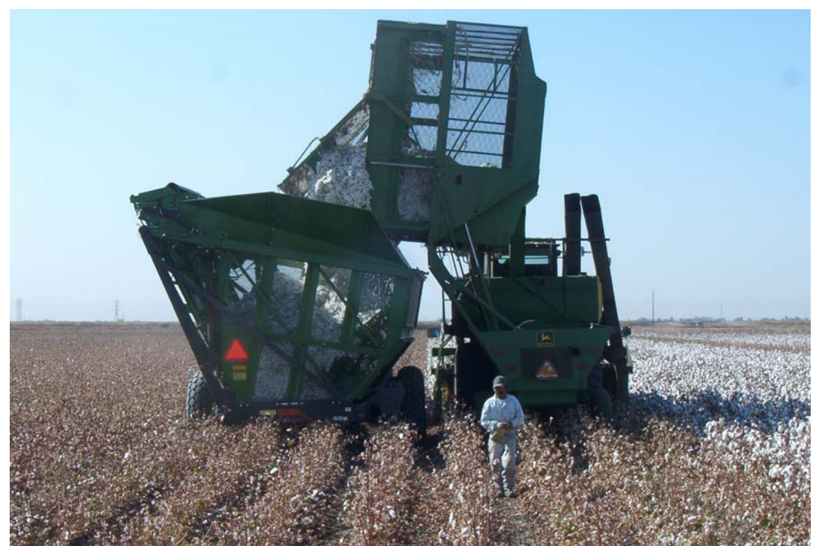
Cotton harvest at a BASIC field.

Partners and Funding: A private nonprofit, the Sustainable Cotton Project has been funded over the past three years by the California State Water Resources Control Board. This funding has enabled the Sustainable Cotton Project to coordinate with participant growers, pest management consultants, University of California Cooperative Extension, and Agricultural Experiment Station researchers to bring biointensive management practices and proven BASIC techniques to California cotton. BASIC is a voluntary, community-based program for cotton growers that helps farmers develop tools that will allow them to not only reduce inputs, but save money. These tools include biological control systems, intensive regular crop monitoring, and information sharing