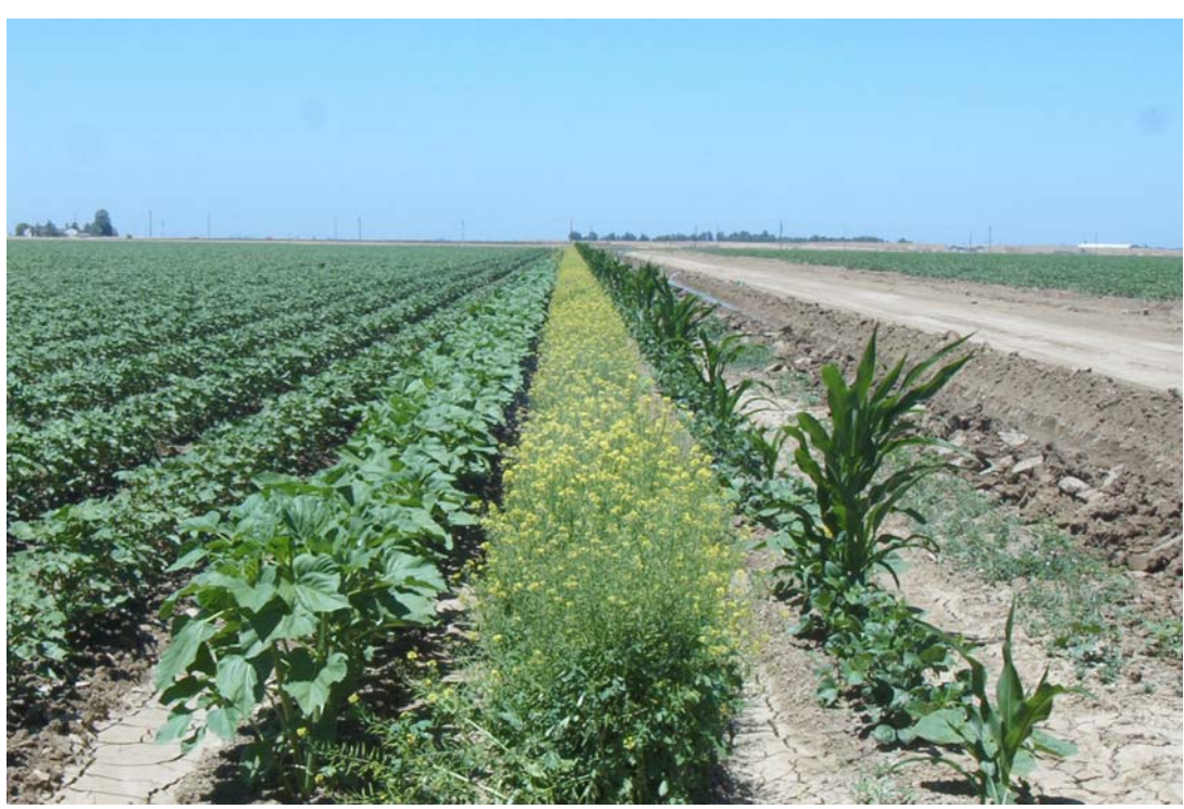
Habitat planted along road edges will protect the cotton crop from the dust of passing vehicles, which will reduce mite damage.

Project Highlights: The project timeframe was 2001-2004. The project served cotton growers representing over 2400 acres in three Central Valley counties: Fresno, Madera and Merced Counties. The primary project highlights included: conversion of cotton acreage in the Northern San Joaquin Valley to BASIC management practices, and reductions of insecticide and miticide use, including chlorpyrifos and all insecticides/miticides that are toxic to fish and wildlife and reduction of synthetic fertilizers.