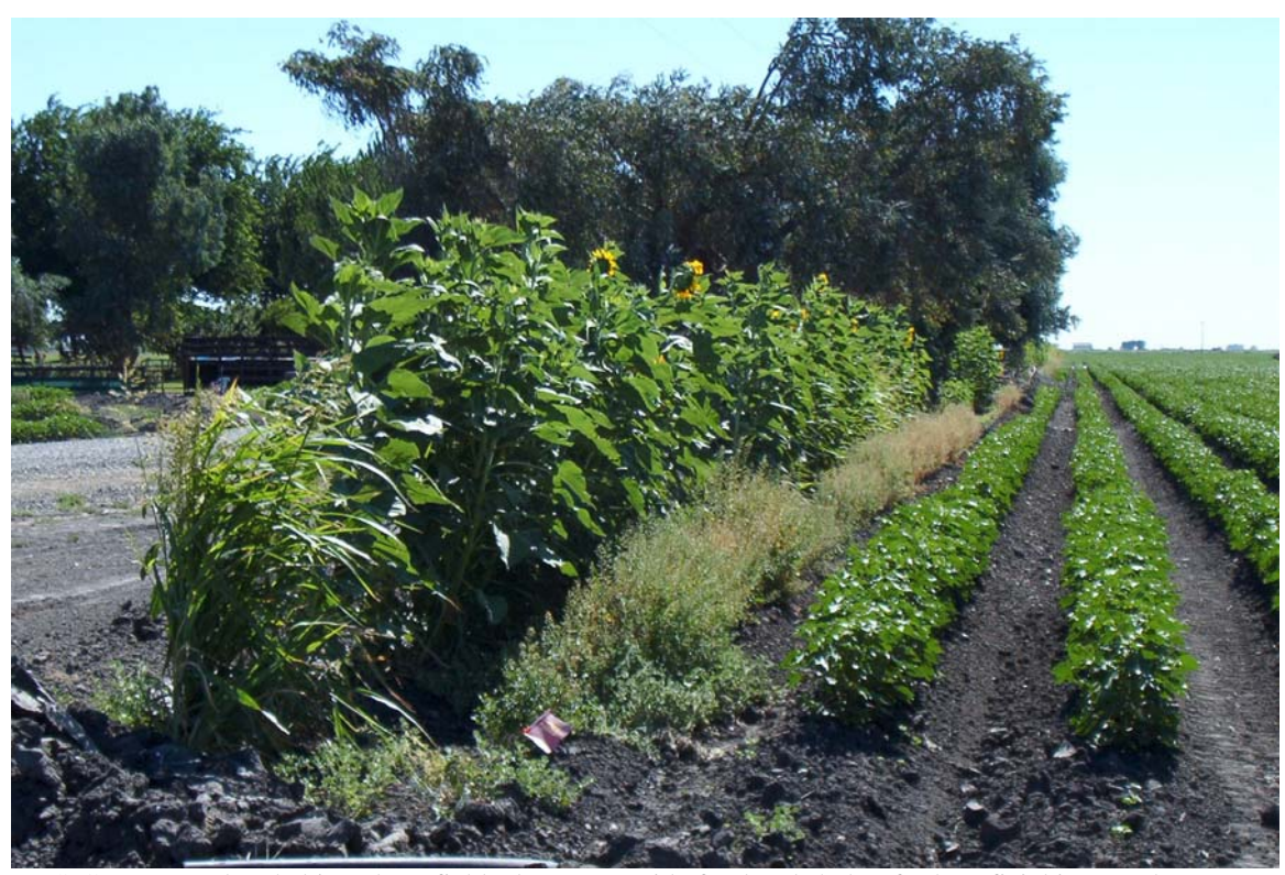
BASIC growers plant habitat along field edges to provide food and shelter for beneficial insects that prey and feed on pest insects in the cotton plants.

Biological Agriculture Systems in Cotton (BASIC) is an agricultural pollution prevention project administered by the Sustainable Cotton Project (SCP). BASIC reduces pollution of ground and surface waters by assisting cotton farmers seeking to reduce or eliminate their use of damaging chemicals, through a farmer-to-farmer mentoring program. The project goals included: conversion of cotton acreage in the Northern San Joaquin Valley to BASIC management practices, reductions of insecticide and miticide use, including chlorpyrifos and all insecticides and miticides that are toxic to fish and wildlife, and reduction of synthetic fertilizers.