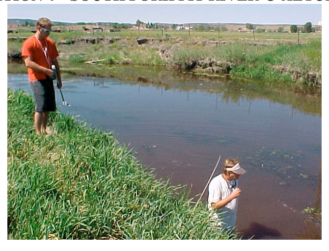
STATION 4 – SOUTH FORK PIT RIVER @ ALTURAS