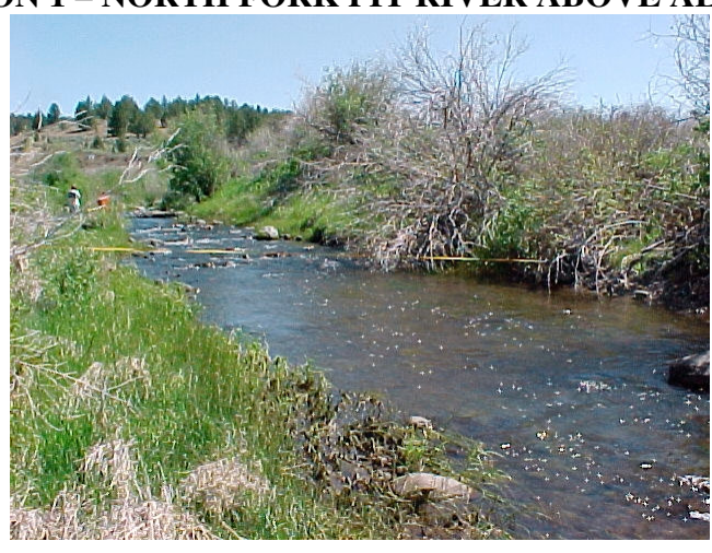
STATION 1 – NORTH FORK PIT RIVER ABOVE ALTURAS