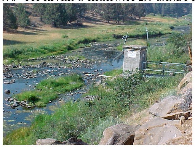
STATION 6 – PIT RIVER @ HIGHWAY 299 CANBY BRIDGE