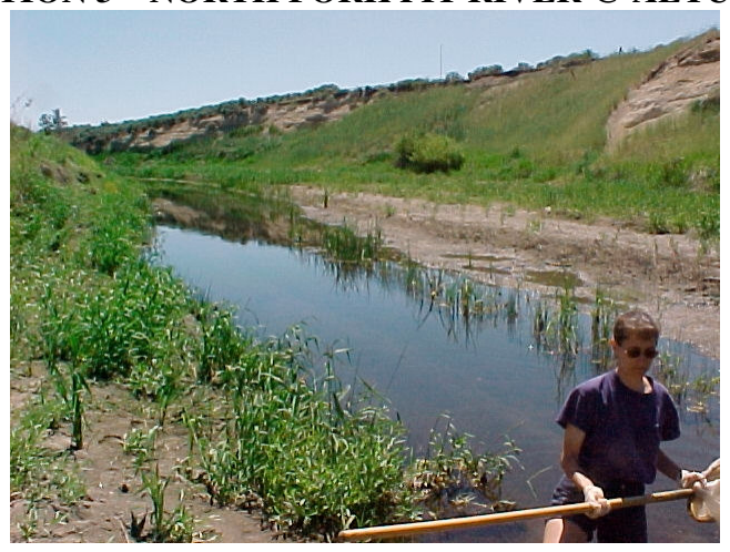
STATION 3 – NORTH FORK PIT RIVER @ ALTURAS