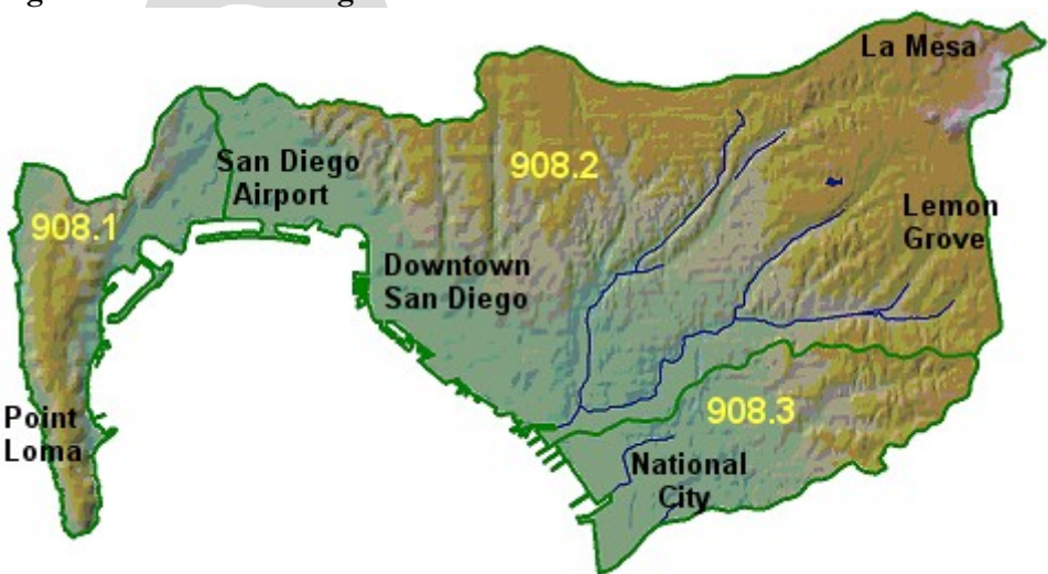
Figure 1: Pueblo San Diego Watershed

The beneficial uses of the inland surface waters in the Pueblo San Diego watershed are limited to contact (potential use) and non-contact recreation, warm freshwater habitat, and wildlife habitat. The San Diego Bay receiving water supports an extensive array of beneficial uses (see Table 3 below).