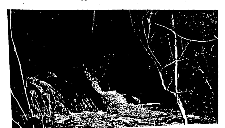
Olds Creek dam was breached by conservation crews to permit fish passage.

One point is clearly evident to sh persons that have been associated with such projects. It is much more practical and less costly to prevent loggin; damage to streams through application of suitable logging practices that it is to correct the damage once done We are hopeful that future logging in these drainages will not repeat the damage incurred in the past.