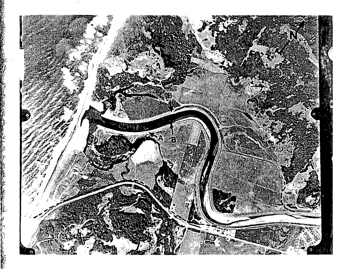
Figure 3. Redwood Creek showing the points of proposed options for restoration: levee spillway, (A); partial levee removal, (B); levee relocation, (Dashed line).

Removal of the lower 1 km of both levees would be similar in expected benefits to the previous option, and carry potential rehabilitation effects into the north slough. This alternative provides for both flood control for the town of Orick and the restoration of historical estuarine circulation patterns.