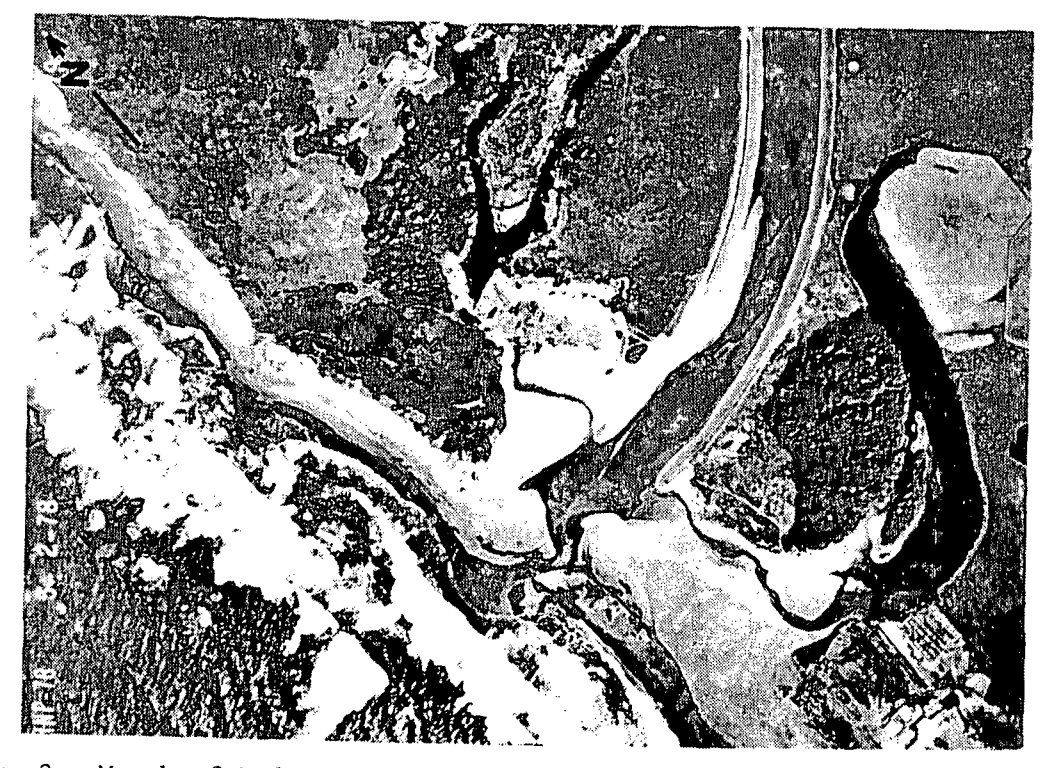
igure 2. Mouth of Redwood Creek in May, 1978, showing flood control levees which were completed in October, 1968. Note sediment accumulation in the mecks of the north and south sloughs.