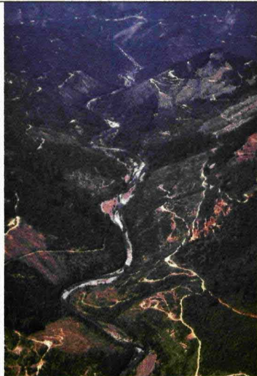
Figure 2. Lower Blue Creek and timber harvest.

“Channels of most Lower Klamath tributaries have continued to fill in as sediment yield in the watersheds remains high. Timber harvest in all Lower Klamath watersheds exceeds cumulative effect thresholds and all streams (except upper Blue Creek) have been severely damaged during the evaluation period. Clear-cut timber harvest in riparian zones on the mainstem of lower Blue Creek and the mainstem Klamath River occurred in 1998 in inner gorge locations. Aggradation in salmon spawning reaches can be expected to persist for decades. Fourteen of the seventeen major tributaries in this region go underground in late summer (Voight and Gale, 1998).”