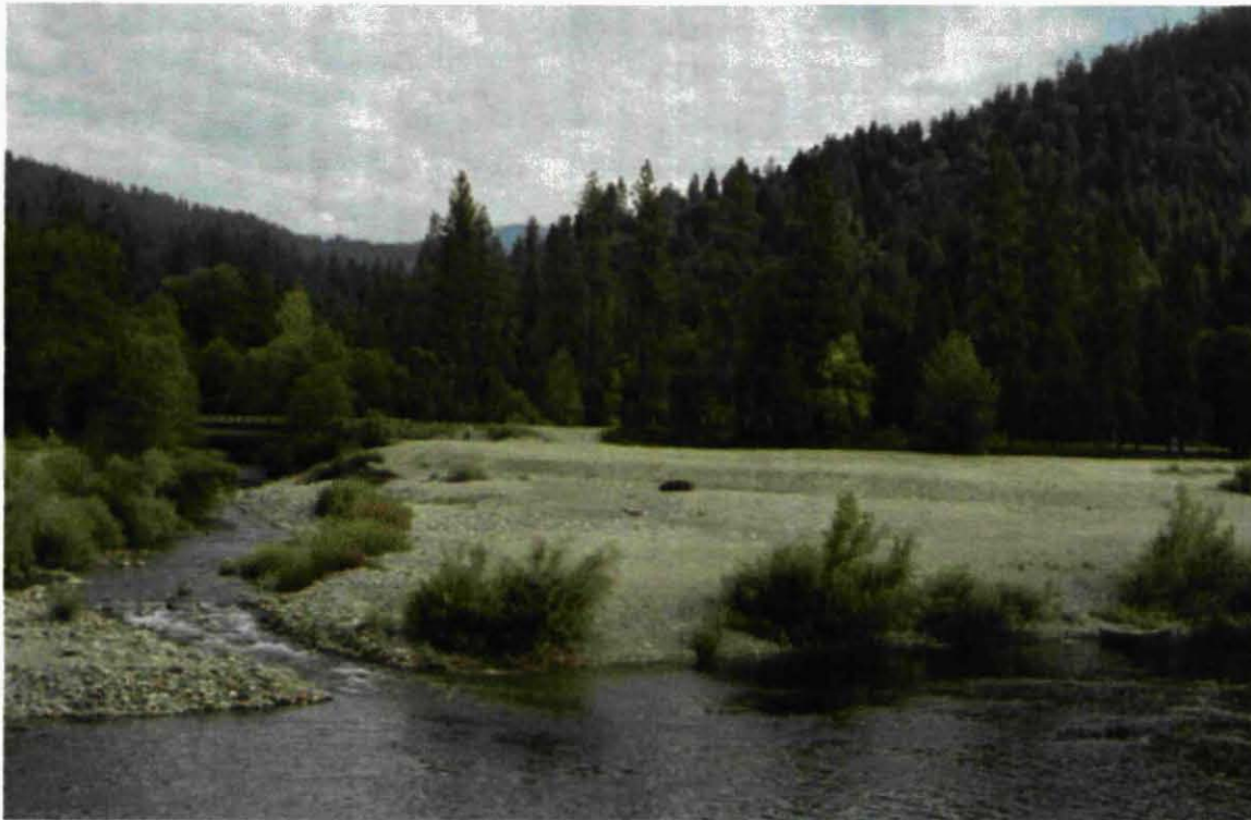
Figure 4. Mouth of Elk Creek. The delta extending to the edge of the photo at right was aggraded more than ten feet after the January 1997 storm.

rain-on-snow event triggered many natural landslides, but that road failures and landslides in clear-cut areas substantially added to sediment yield in some watersheds. Impacted tributaries are listed in Table 2, which shows the magnitude of stream damage and antecedent land use or events. The stream damage level is indicative of the amount of sediment contributed to the mainstem Klamath River.