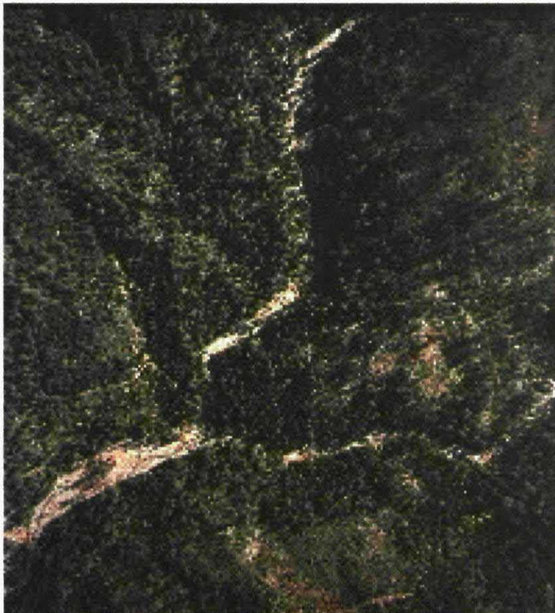
Figure 3. This aerial photo shows tracks of debris torrents in Walker Creek, which buried the stream channel and extended all the way to the mainstem Klamath River.

Contributions of sediment to the mainstem Klamath River between the Salmon River and Beaver Creek, including the Scott River and its tributaries, were documented by de la Fuente and Elder (1998). They noted that the January 1, 1997 storm caused hundreds of landslides in the Klamath National Forest and 446 miles of scouring in tributary channels (Figure 3).