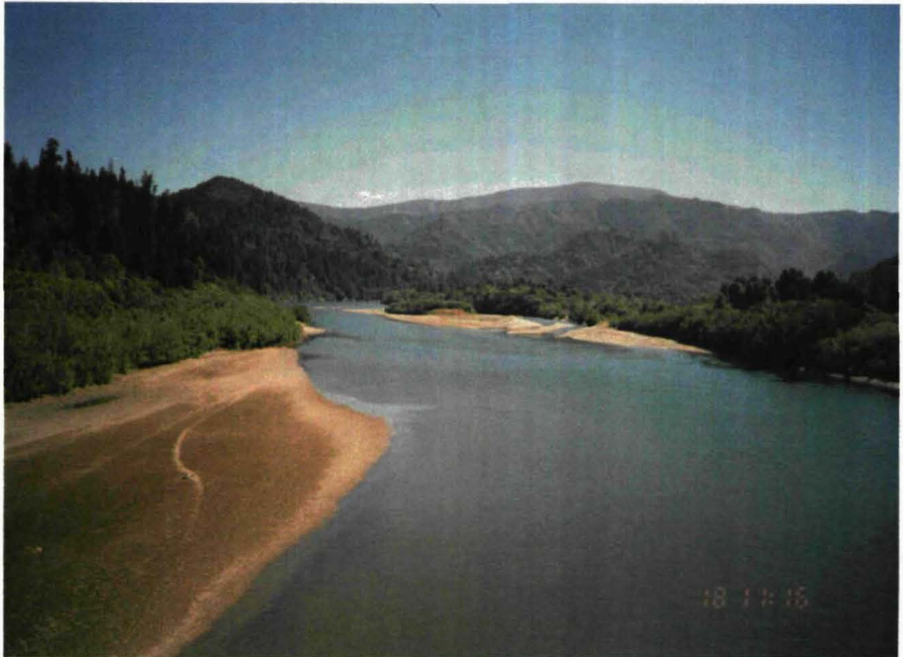
Figure 1. Lower Klamath above Highway 101 with sediment deposits in the margins.

Voight and Gale (1998) noted that 17 of 23 tributaries to the lower Klamath River remained underground, indicating lack of recovery and continuing contributions of sediment. Figure 1 shows the lower Klamath River in 1998, looking upstream from the Highway 101 bridge. Sediment deposits in the margins indicate sediment impairment.