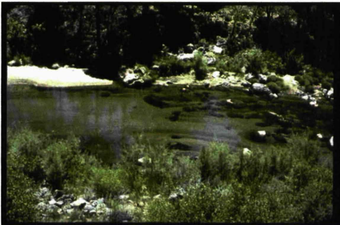
Figure 5. The mainstem Scott River stream bed below Jones Beach has a high amount of decomposed granite sand, contributed from upland. This sand also makes its way into the Klamath River.

The de la Fuente and Elder (1998) noted major sediment contributions from the Scott River and its tributaries during the January 1997 storm. Longer term studies (Sommerstrom et al., 1991) show that huge amounts of decomposed granite sands are in the Scott River (Figure 5) as a result of land use activities. The National Academy of Sciences (2003) report on the Klamath River and Endangered fishes also recognized Scott River impairment: "Highly erodible decomposed granite has led to a serious loss in volume and number of pools in tributaries and associated degradation of spawning and rearing habitat. Logging over the past 50 years has taken place on a mix of USFS land and land held by a few large private timber companies. Historical logging practices have been poor, particularly on private land, and have left a legacy of degraded hillslope and stream conditions." The Scott sends a constant supply of sand to the mainstem Klamath, contributing to its sediment impairment.