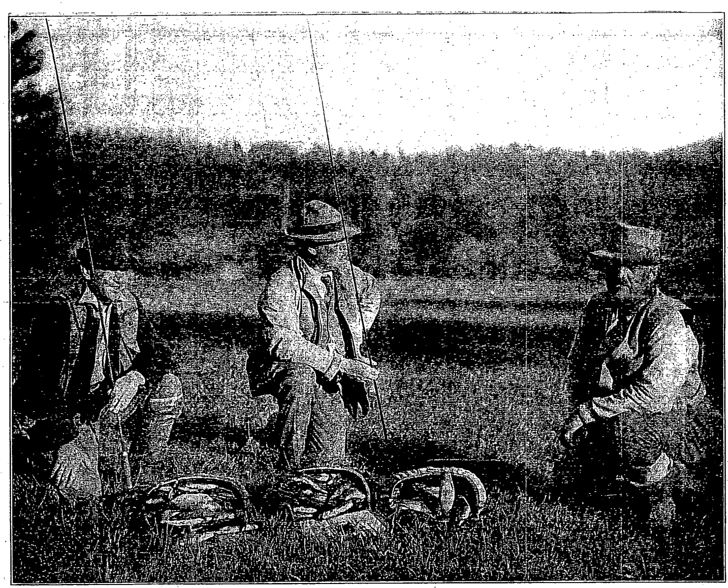
What a Day of Quick Casts Means in the Feather River Country.