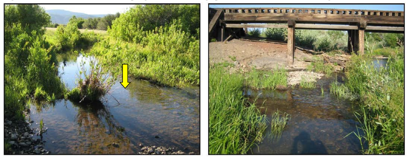
Figure 6.4.3 Lower Lassen Creek sampling site (LC 1), facing upstream (left) and downstream (right).