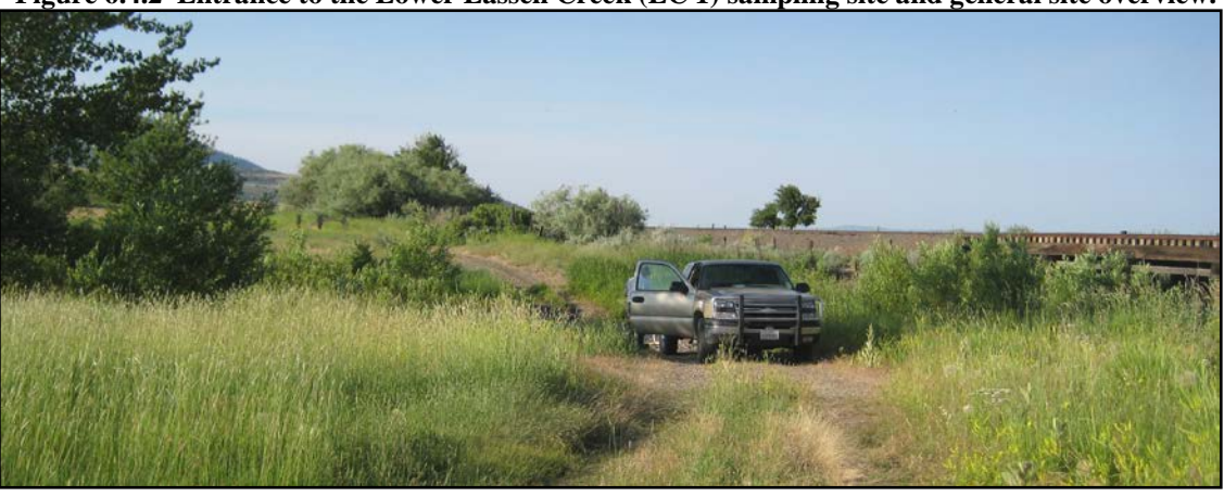
Figure 6.4.2 Entrance to the Lower Lassen Creek (LC 1) sampling site and general site overview.

In this monitoring effort, one primary monitoring site will be considered representative of the Coalition area as a whole. This site, known as Lower Lassen Creek, or LC 1, is located below all irrigated agriculture activities in the Lassen Creek drainage. The site is below Highway 395 but immediately above where the local railroad crosses the creek. Directly upstream of the sampling site are irrigated meadows used for both hay production and livestock grazing. The sampling site is near a traditional crossing site where ranch vehicles and hay equipment move across the stream channel. All samples have been and will continue to be collected above the crossing to avoid any influence of the crossing in our results. Figures 6.4.2 and 6.4.3 show the LC 1 monitoring site, including the entrance to the sampling location and overview of the area, as well as the upstream and downstream views from the sample site. The yellow arrow in Figure 6.4.3 indicates the approximate location where samples will be collected.